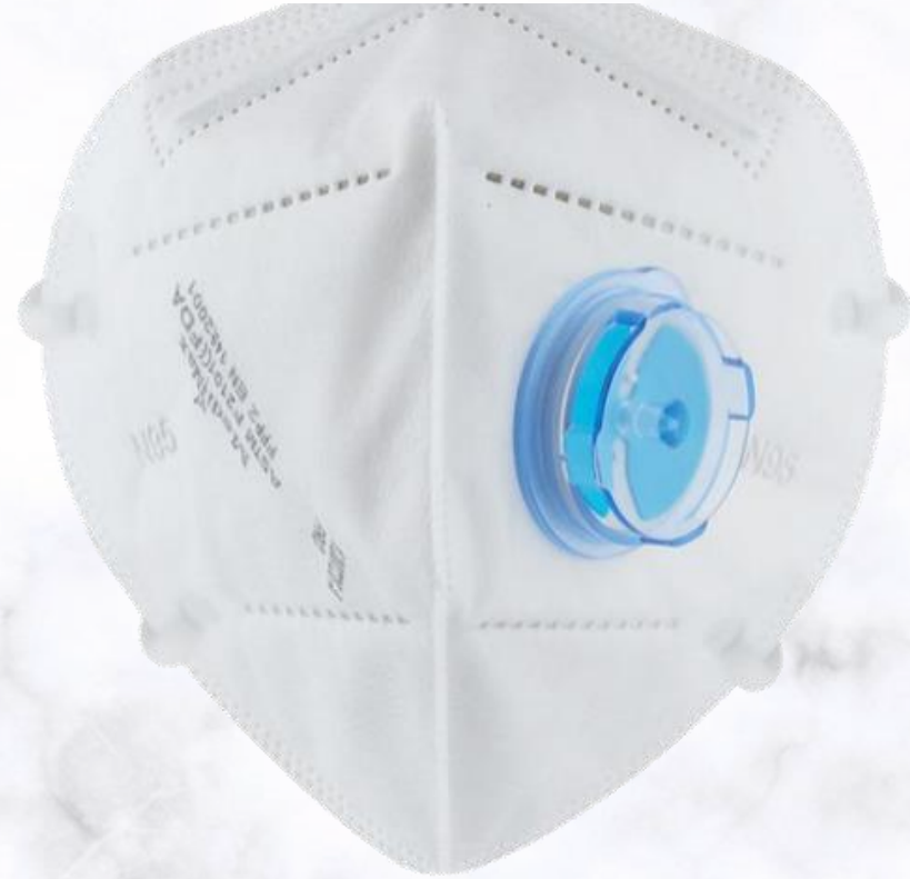
N95 PRO WITH VALVE