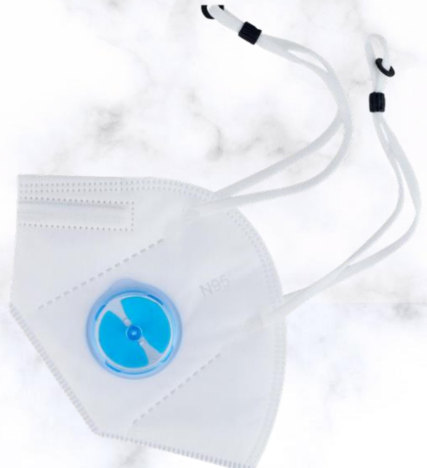
N95 PRO WITH EARLOOP