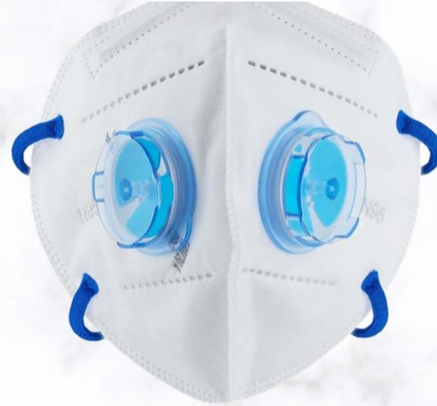
N95 PRO WITH DOUBLE VALVE