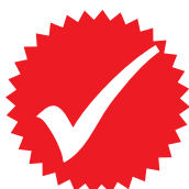
Head of Certificate

This Certificate of Registration is granted subject to the Regulations approved by the Board. PROGRESSIVE INTERNATIONAL CERTIFICATIONS LTD. Office 4, 219, Kensington High Street, Kensington, London, W8 6BD, England. E-mail.: info@picluk.com , Website: www.picluk.com For current validity of this certificate. Please visit our website