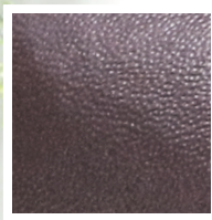
ROBUST SYNTHETIC LEATHER UPPER