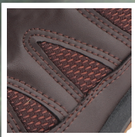
BREATHABLE AIR VENTS