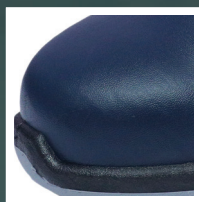
STEEL TOE CAP