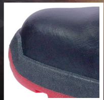
STEEL TOE CAP