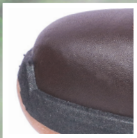
STEEL TOE CAP