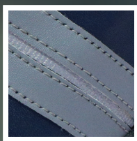
REFLECTIVE TAPES FOR NIGHT VISIBILITY