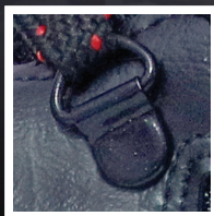
ANTI RUST D-TYPE EYELETS