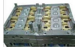
Hard Chrome Rubber Dies