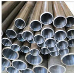
Honed & Mirror Finish Tubes