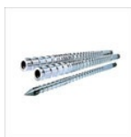
PLATING SCREW BARREL