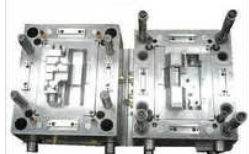
Hard Chrome Injection Moulding Dies