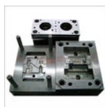
Industrial Dies Casting Components