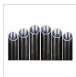
Hydraulic Honed Tube