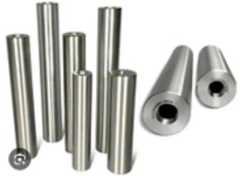
Rotogravure Printing Base Shell Cylinder