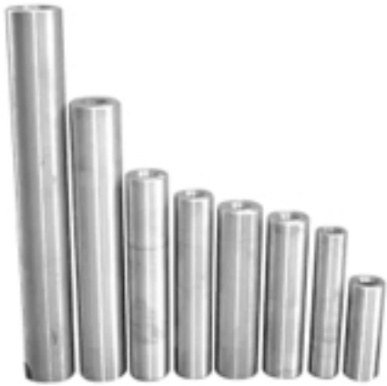
Stainless Steel Base Shell Cylinder