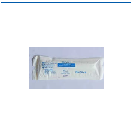
2.0 MM BIOVIVE OPHTHALMIC CRESCENT KNIFE

1.5mm Dermal Biopsy Punch, 1.8mm Ophthalmic Keratom, 14mm Solid Blade Wire Eye Speculum, 15 Degree Tip Knife Ophthalmic Lance, 18G Regular Air Cannula, 19G Regular Air Cannula, 1mm Dermal Biopsy Punch, 2.0 mm BioVive Ophthalmic Crescent knife, 2.2mm Bevel Up Ophthalmic Crescent Knife, 2.5mm Dermal Biopsy Punch, 2.6 mm BioVive Ophthalmic Crescent Knife, 2.8mm Bevel Up Ophthalmic Crescent Knife, 2.8mm Ophthalmic Keratome Bevel Up, 2.8mm Ophthalmic Slit Keratome knife, 20 G BioVive Ophthalmic MVR Blade, etc.