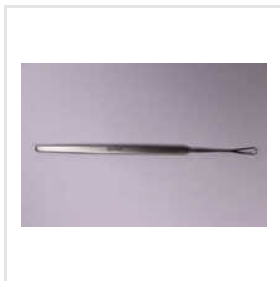
Lewis Lens Loop