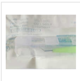
2.6 Mm BioVive Ophthalmic Crescent