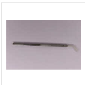
Nagahara Sharp Phaco Chopper