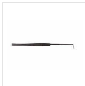
Smith Lens Expressor