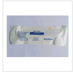
5.1 Mm BioVive Ophthalmic Crescent