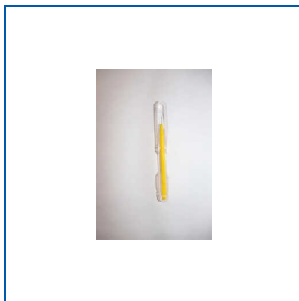
15 DEGREE TIP KNIFE OPHTHALMIC LANCE