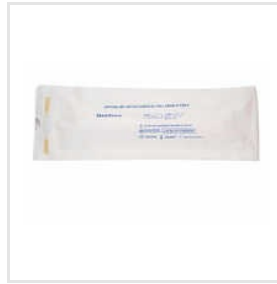
1.8mm Ophthalmic Keratom