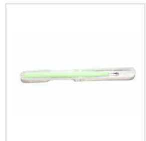
2.8mm Bevel Up Ophthalmic Crescent