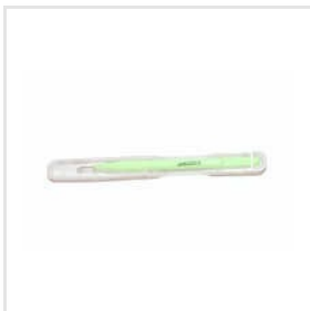
2.2mm Bevel Up Ophthalmic Crescent