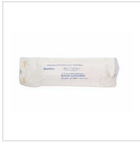
2.8mm Ophthalmic Keratome Bevel Up