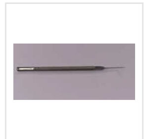
Agarwal Phaco Chopper