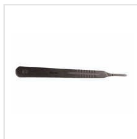
Bard Parker Handle