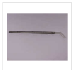
Sinsky II Lens Manipulating Hook