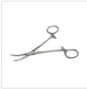
6 Inch Artery Forceps Straight And Curved