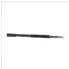
Castroviejo Razor Blade Breaker And