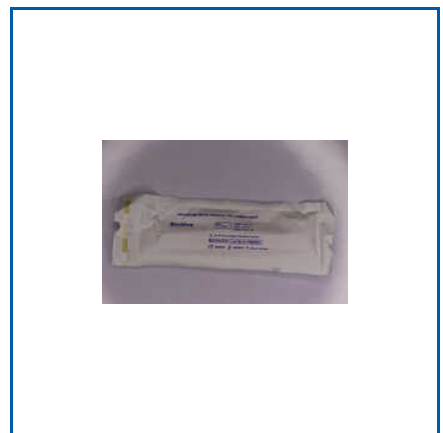
2.8MM OPHTHALMIC SLIT KERATOME KNIFE