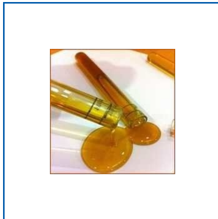
LONG OIL ALKYD RESIN