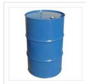
Long Oil Alkyd