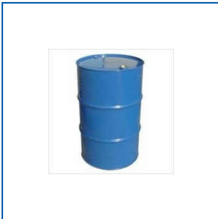
LONG OIL ALKYD

Acrylated Alkyd, Acrylic Alkyd, Alkyd Resins, CNSL Resin, Cashew Nut Shell Liquid Resin, Chain Stopped Alkyd, DB Castor Oil, Hammertone Alkyd, Liquid Phenolic Resin, Long Oil Alkyd, Long Oil Alkyd Resin, Maleic Resin, Malice Modified Resin, Penta Ester Gum, Phenolic Resin, etc.