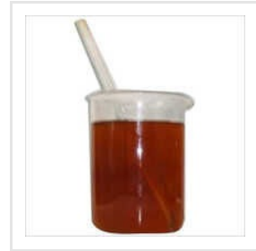
Short Oil Alkyd