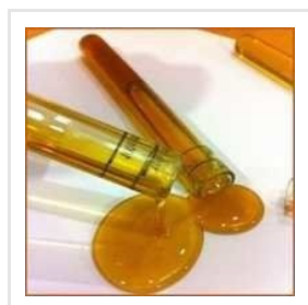
Long Oil Alkyd Resin