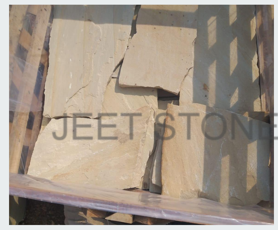
Natural Sandstone Crazy