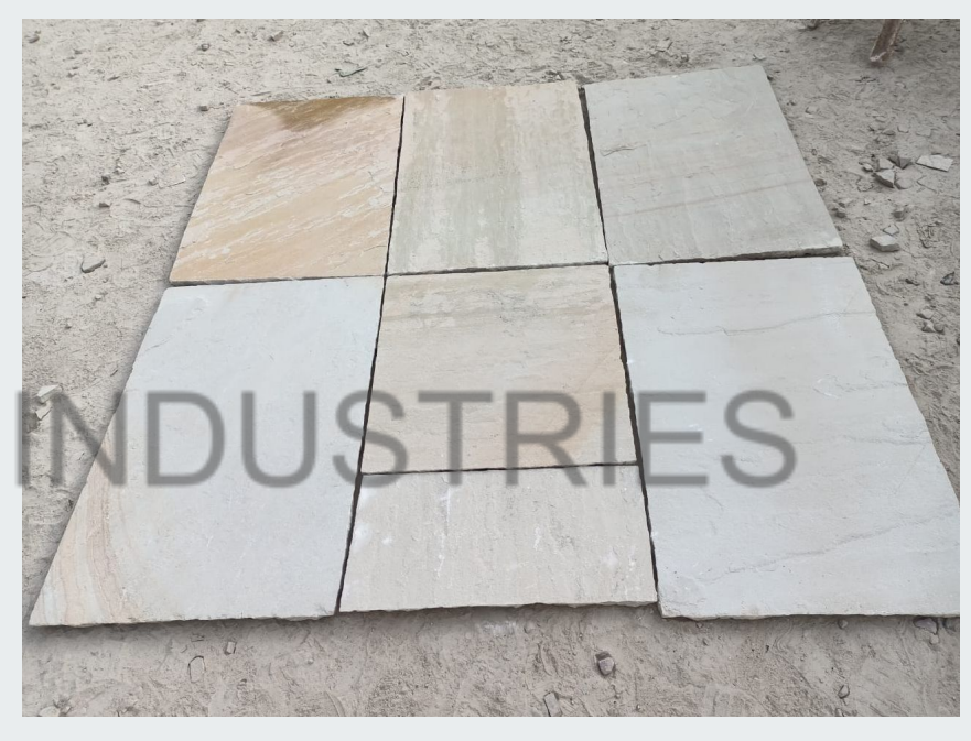
Fossil Mint Sandstone