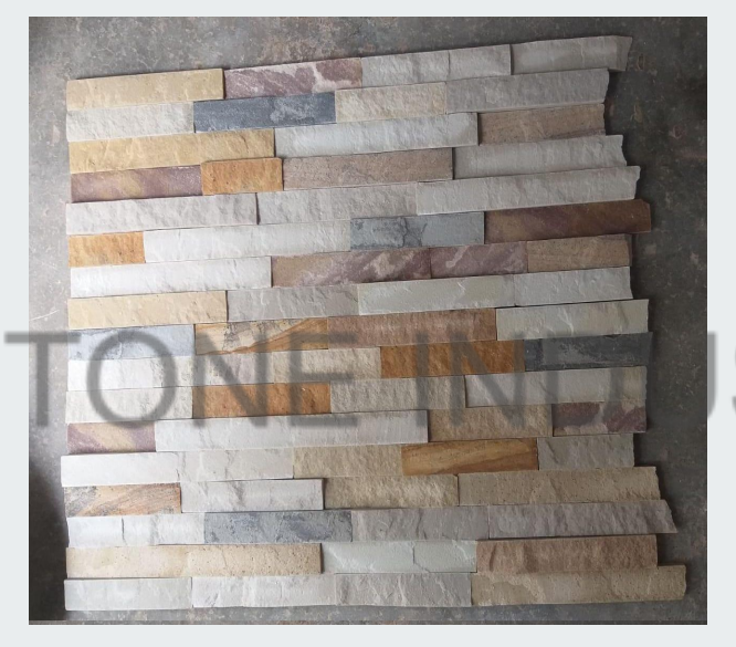
Multi-colour wall cladding