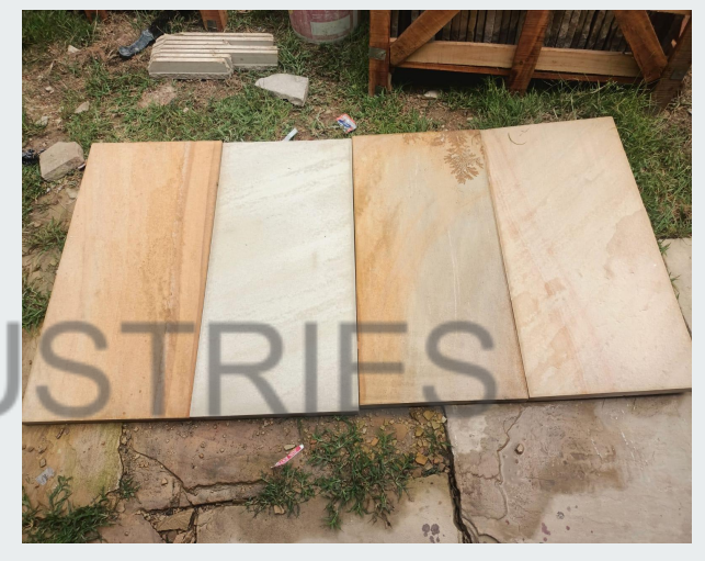
Natural Yellow mint sandstone (sawn edges)