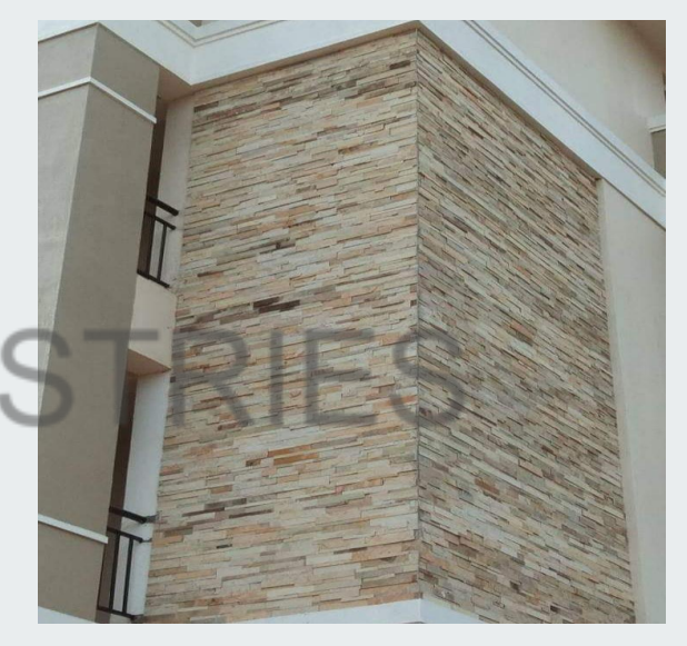
Multi-colour wall panel

Sandstone wall claddings and panels deliver a timeless, textured elegance to any façade, enhancing both modern and classic architectural styles. Their robust durability and natural beauty make them perfect for creating striking feature walls and stylish exteriors.