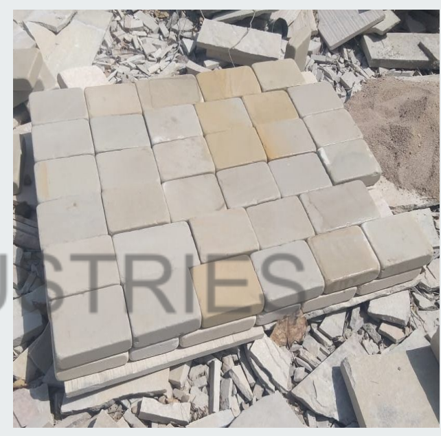
Natural Mint Sandstone Cobbles