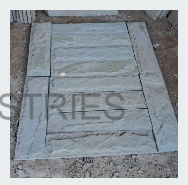
Mint sandstone cladding