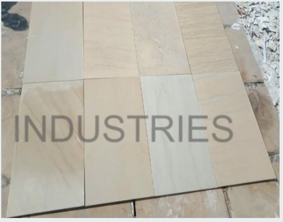
Yellow Mint Honed Top Sandstones with Sawn Edges