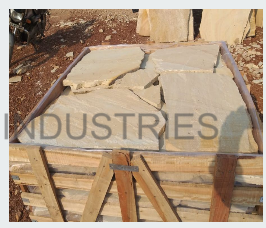
Natural Sandstone Crazy

Natural sandstone crazy stone features a unique, irregular pattern that adds character and charm to any surface. Ideal for creating dynamic, eye-catching patios, walkways, and walls, it combines aesthetic appeal with durability for versatile outdoor applications.