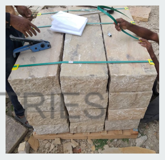
Block steps Block steps Block steps

Sandstone Block Steps: Durable and slip-resistant steps made from high-quality sandstone blocks, offering a natural and rustic appeal. Ideal for landscaping, garden pathways, and outdoor stairs, these steps are weather-resistant and provide excellent grip underfoot.