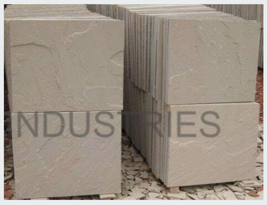
Dholpur Beige Sandstone