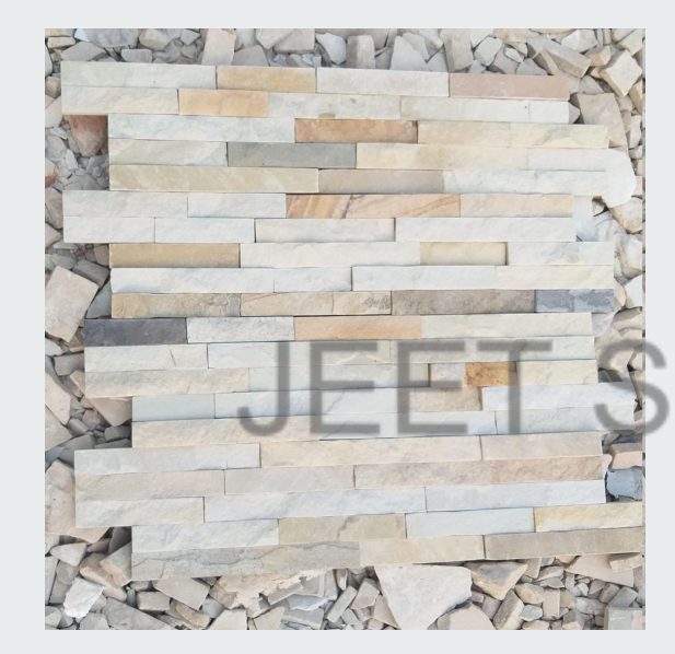
Multi-colour wall cladding