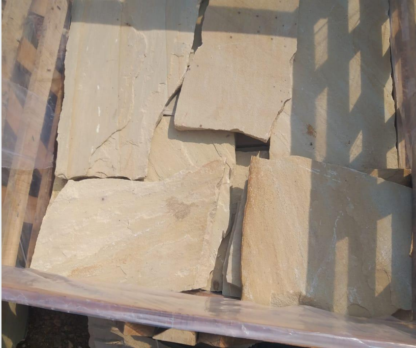
Natural Sandstone Crazy