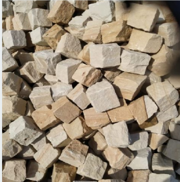
Natural Mint Sandstone Cobbles