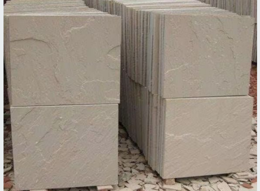
Dholpur Beige Sandstone

Dholpur Beige sandstone exudes a warm, inviting tone with its subtle beige hues, perfect for adding elegance to both modern and traditional settings. Its versatile nature makes it ideal for use in flooring, wall cladding, and outdoor paving, providing a sophisticated and durable solution.