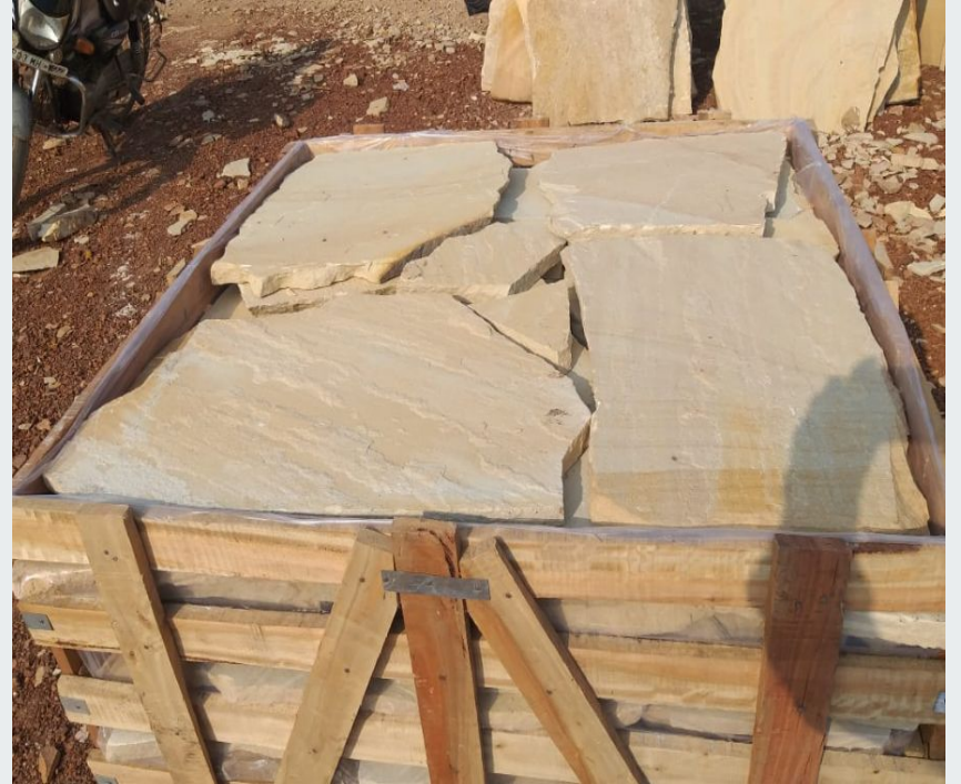
Natural Sandstone Crazy

Natural sandstone crazy stone features a unique, irregular pattern that adds character and charm to any surface. Ideal for creating dynamic, eye-catching patios, walkways, and walls, it combines aesthetic appeal with durability for versatile outdoor applications.