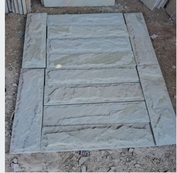
Rock face cladding

Sandstone wall claddings and panels deliver a timeless, textured elegance to any façade, enhancing both modern and classic architectural styles. Their robust durability and natural beauty make them perfect for creating striking feature walls and stylish exteriors.