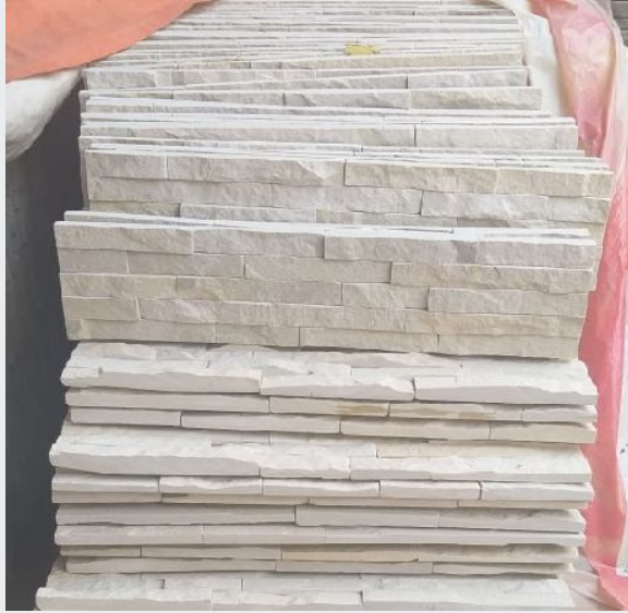
Mint sandstone cladding