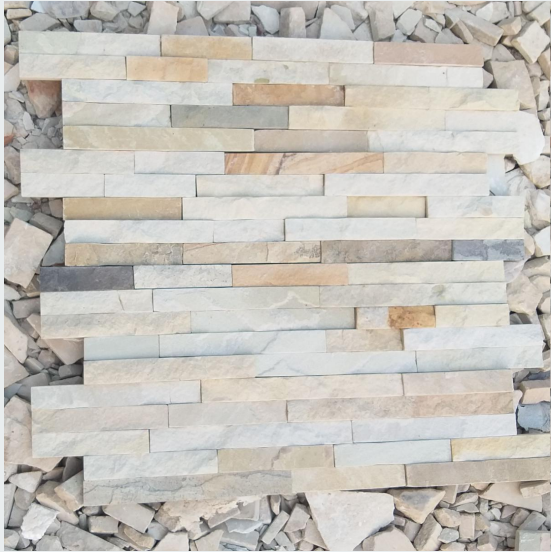
Multi-colour wall cladding