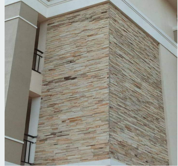
Multi-colour wall panel

Sandstone wall claddings and panels deliver a timeless, textured elegance to any façade, enhancing both modern and classic architectural styles. Their robust durability and natural beauty make them perfect for creating striking feature walls and stylish exteriors.