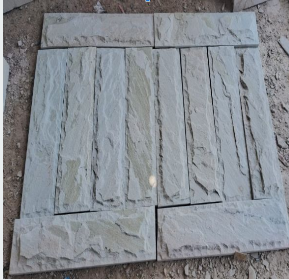
Rock face cladding