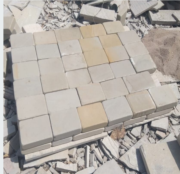
Yellow Mint Honed Cobbles Sawn & Tumbled

Sandstone cobbles offer a rustic charm and durability, ideal for creating picturesque pathways and driveways. Their natural texture and sturdy composition make them a lasting choice for both residential and commercial landscapes.