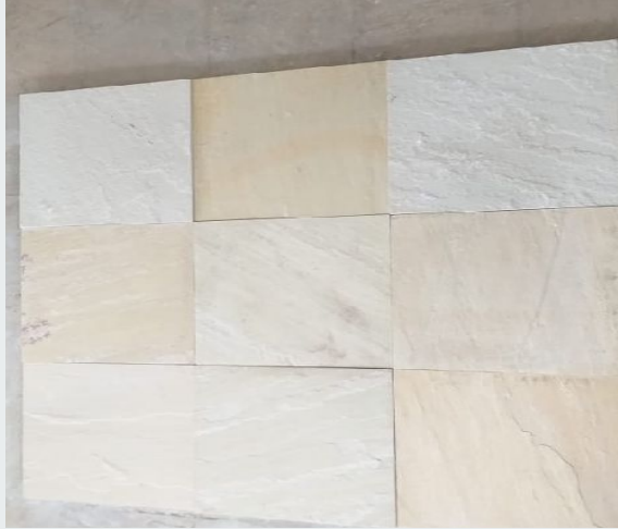
Natural Yellow mint sandstone (sawn edges)