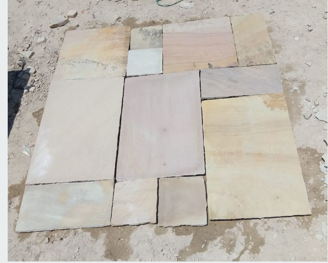
Fossil Mint Sandstone

Mint Fossil Sandstone presents soft green tones accented with gentle beige undertones, fostering a serene and revitalizing environment. Its fossilized patterns add a unique character to walls, floors, and various architectural features, enabling the creation of distinctive and engaging spaces.