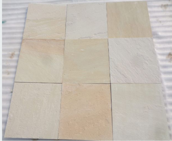
Natural Yellow mint sandstone (sawn edges)