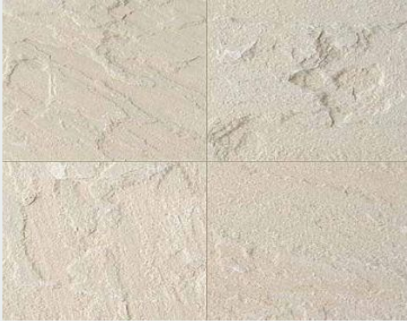
Dholpur Beige Sandstone