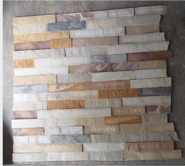
Multi-colour wall cladding