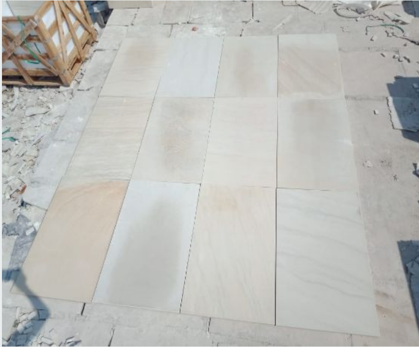
Yellow Mint Honed Top Sandstones with Sawn Edges