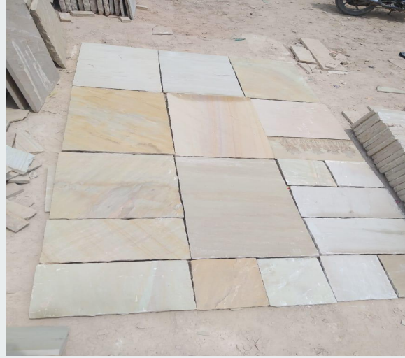
Fossil Mint Sandstone