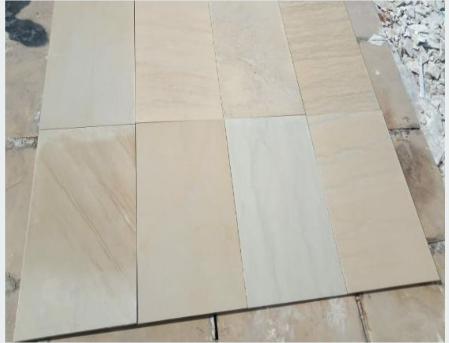
Yellow Mint Honed Top Sandstones with Sawn Edges

Yellow Mint Honed Top Sandstone: A refined sandstone with a smooth, honed finish and a soft yellow-mint hue, perfect for creating sophisticated indoor and outdoor surfaces. Known for its durability and slip resistance, it's ideal for patios, flooring, and wall cladding, adding elegance to any space.