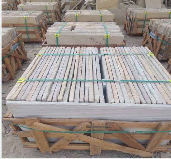
Fossil Mint Sandstone