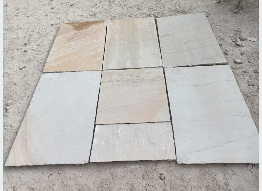
Fossil Mint Sandstone

Mint Fossil Sandstone presents soft green tones accented with gentle beige undertones, fostering a serene and revitalizing environment. Its fossilized patterns add a unique character to walls, floors, and various architectural features, enabling the creation of distinctive and engaging spaces.