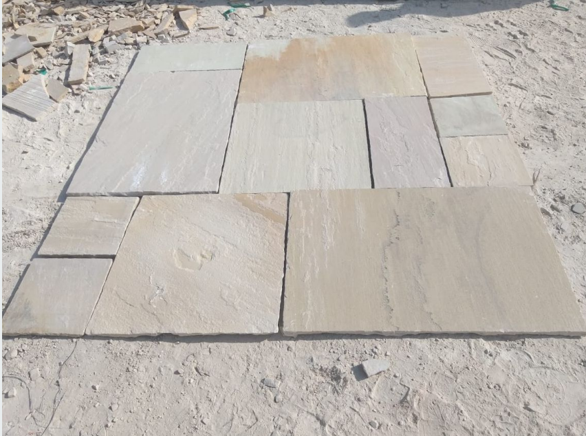
Fossil Mint Sandstone