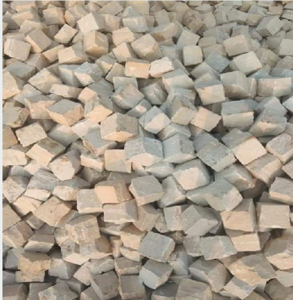
Natural Mint Sandstone Cobbles