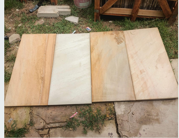
Natural Yellow mint sandstone (sawn edges)

Yellow Mint Sandstone: A stunning natural stone with a warm yellow hue and subtle mint undertones, perfect for adding a unique and elegant touch to any interior or exterior space.