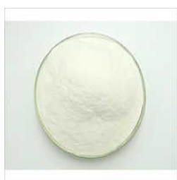
PHARMACEUTICAL GRADE SODIUM CARBOXYMETHYL CELLULOSE

Animal Feed Binder, Binding Paper Sodium Carboxymethyl Starch, Cellulose Fiber, Coal Briquette Binders, Cosmetic Grade Sodium Carboxymethyl Cellulose, Detergent Grade Sodium Carboxymethyl Cellulose, Drilling Modified Starch, Drilling Starch, etc.