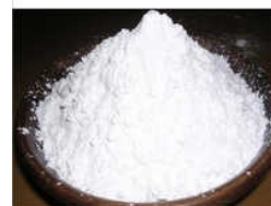
Sodium Carboxymethyl Starch