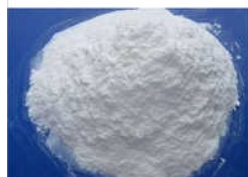
Detergent Grade Sodium