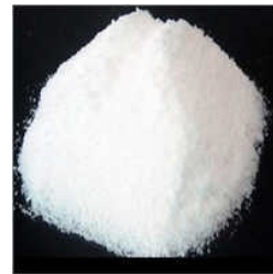
Potato Pregel Starch