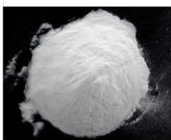
Polyanionic Cellulose Polymer