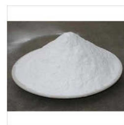
PAINT GRADE SODIUM CARBOXYMETHYL CELLULOSE