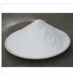
COSMETIC GRADE SODIUM CARBOXYMETHYL CELLULOSE