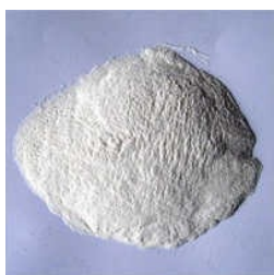
Binding Paper Sodium Carboxymethyl Starch