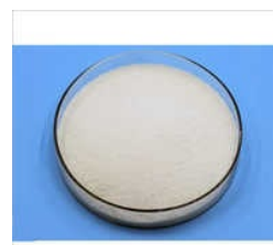
Oil Drilling Starch