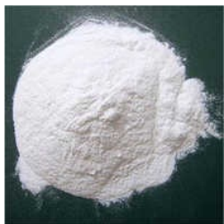
Sodium Starch Derivative