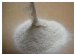
Pregelatinized Maize Starch