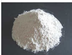
Partially Pregelatinized Starch