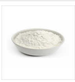
Drilling Modified Starch