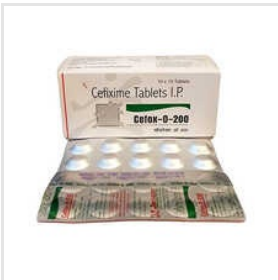
Cefixime Tablets IP