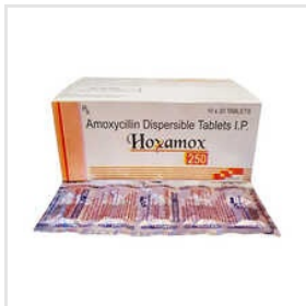
250 MG Amoxicillin Dispersible Tablets IP