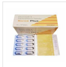
Etoricoxib And Paracetamol Tablets