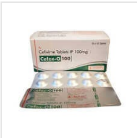
100 MG Cefixime Tablets IP