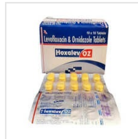
Levofloxacin And Ornidazole Tablets