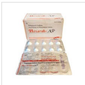
Rebeprazole Sodium Aceclofenac And