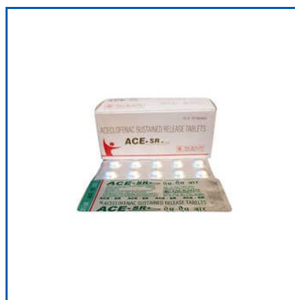
ACECLOFENAC SUSTAINED RELEASE TABLETS