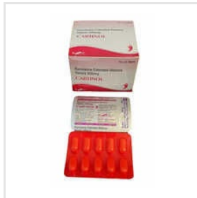
500 MG Ranolazine Extended-Release