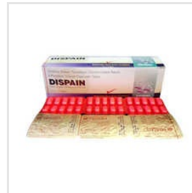
Diclofenac Sodium Paracetamol