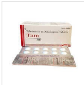
Telmisartan And Amlodipine Tablets