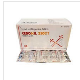
Cefadroxil Dispersible Tablets