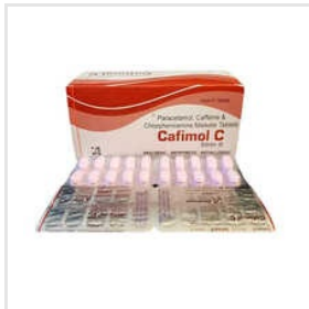
Paracetamol Caffeine And Chlorpheniramine