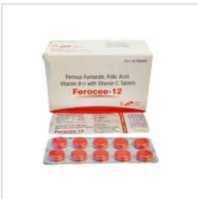
Ferrous Fumarate Folic Acid Vitamin B12 And