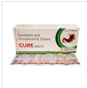
Ranitidine And Domperidone Tablets