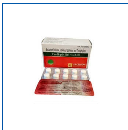
ETOFYLLINE AND THEOPHYLLINE SUSTAINED RELEASE TABLETS