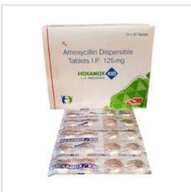
125 MG Amoxicillin Dispersible Tablets IP