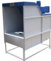
Front Open Water Curtain Industrial Paint