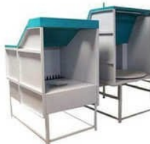
Bench Spray Paint Booth