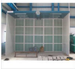
Dry Type Front Open Spray Painting Booth