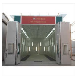
Bus Paint Booth