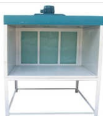
Dry Type Front Open Small Size Industrial