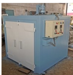
Wet Type Paint Booths