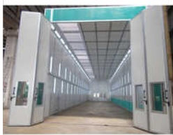
Windmill Spray Painting Booth