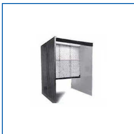
SPRAY PAINT BOOTH

Automobile Paint Booth, Automobile Painting Booth, Automobile Paints Booth, Automobile Spray Booth, Automotive Paint Booth, Bench Spray Paint Booth, Bench Spray Painting Booth, Bus Paint Booth, Camel Back Industrial Ovens, Car Paint Booth, Car Painting Booth, Conveyor Painting Plant, Conveyor Painting Plants, Conveyor Spray Paint Plant, Conveyorised Painting Booth, etc.