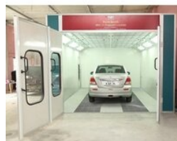
Car Painting Booth