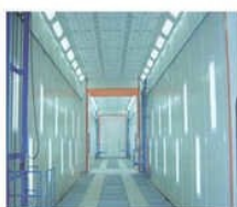
Truck Paint Booth