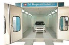
Water Wash Spray Painting Booth