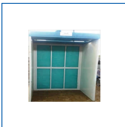
DRY TYPE FRONT OPEN MEDIUM SIZE INDUSTRIAL PAINT BOOTH