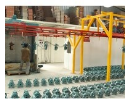
Conveyor Spray Paint Plant