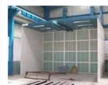
Two Wheeler Paint Booth