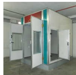
Two Wheeler Paint Booth