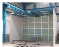
PTFE Coating Plant