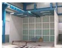
Wet Type Spray Paint Booth