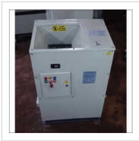
PS-300-OHMC Dual Shaft Waste Shredder