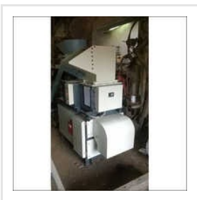
Jumbo Bag Shredder