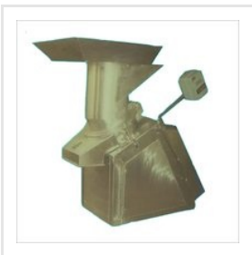
Pharma Scrap Disposal Machine