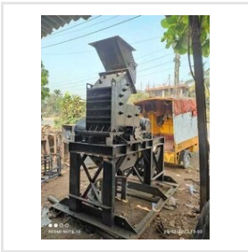
Industrial Hammer Mills