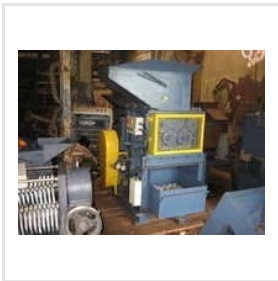
Shredder For Compost