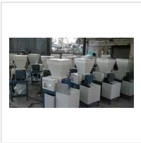
Medical Waste Shredder As Per CPCB