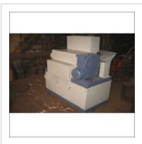
PS-600 Series Industrial Shredders