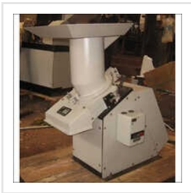
Paper Dish Grinder