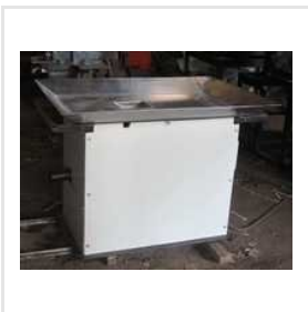
Bio Crusher For Bio Gas Plant