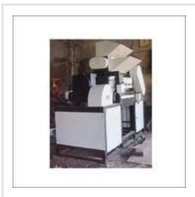
PS-600-H Series Shredders Machine