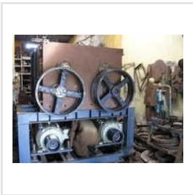
Heavy Duty Shredding Mill