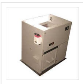
Auto Reverse Shredder Machine