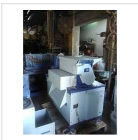
Blisters, Foils, Laminated Plastic