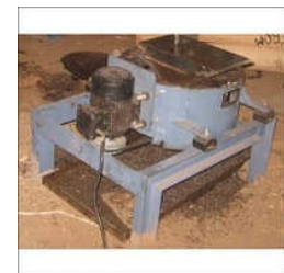
CONTINUOUS CHIP WRINGER MACHINE