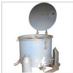
BATCH TYPE CHIP WRINGER

800 - 1000 Kg hr Tyre Shredder, Adhesive Label Grinder, Agricultural Farm Waste Shredder, Agriculture Fruits Packing Shredder Machine, Aluminium Bales Shredder, Aluminium Strips/Foils Shredder, Aluminum Roll Shredder, Amey Bottle Shredder Machine, Amey Engineers Fine Crusher, Amey Hammer Crusher, Amey Hammer Mill For Aluminum Copper Radiators Recycling, Amey Hammer Mill For Cast Aluminum Scrap, Amey Hammer Mill For Electric Motor Recycling, Amey Organic Waste Shredder, Amey Pharma Waste Shredder Machine, etc.