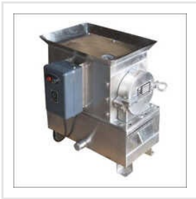
Heavy Duty Shredding Machine