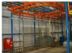
INDUSTRIAL OVERHEAD CONVEYOR