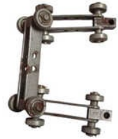
Four Wheel Bi Planar Chain Overhead