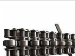
SS Accumulator Chain