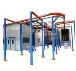
Conveyorised Powder Coating Plant