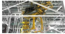
Mild Steel Industrial Overhead Conveyors