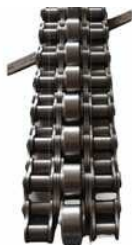
SS Accumulator Chain