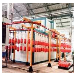
LPG Painting Conveyor