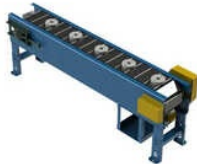
Slat Chain Conveyor