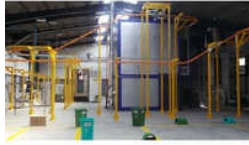
Aluminum Metal Powder Coating Plant