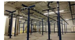
MILD STEEL PAINT SHOP OVERHEAD CONVEYOR