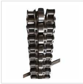
SS Accumulator Chain