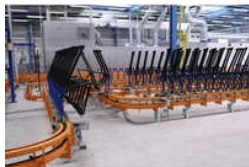
Inverted Floor Conveyor