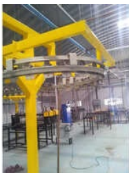
THREE WHEEL TROLLEY OVERHEAD CONVEYOR

4 inch Shoe Conveyor Chain, Aluminium ED Coating conveyor, Aluminum Metal Powder Coating Plant, Conveyor for Bottling Plants, Conveyorised Powder Coating Plant, Dip Painting Conveyor, Floor Conveyor Systems, Four Wheel Bi Planar Chain Overhead Conveyor, Four Wheel Monorail Conveyor, I Beam Conveyor, I Beam Conveyors, I Beam Overhead Conveyors, Industrial Overhead Conveyor, Inverted Floor Conveyor, LPG painting Conveyor, etc.