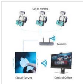
IoT Based Flow Meter With Cloud Based