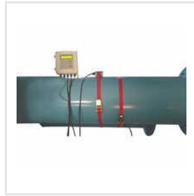
Clamp On Type Ultrasonic Flow Meter