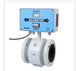
Full Bore Electromagnetic Flow