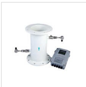
Insertion Ultrasonic Flow Meter