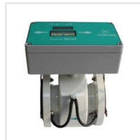
Battery Operated Electromagnetic Flow