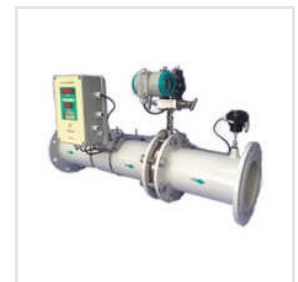
Orifice Gas Flow Meter