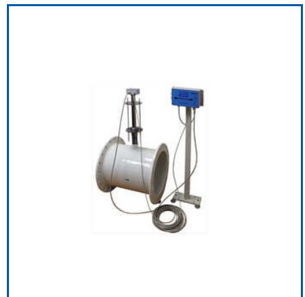
INSERTION TYPE ELECTROMAGNETIC FLOW METER