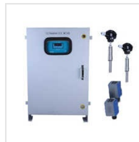
Ultrasonic BTU Meter