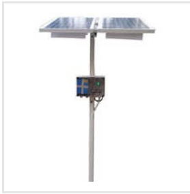
Industrial Solar Powered Flow Meter