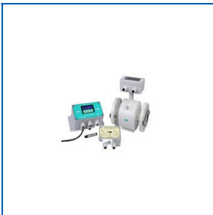
ELECTROMAGNETIC FLOW METER WITH TELEMTRY SYSTEM MODEM

BTU Meter, Compact Gas flow meter, Compact steam flow meter, Digital Electromagnetic Flow Meter, Digital Flow Meter, Digital Gas Flow Meter, Electromagnetic Flow Meter, Gas Flow Totaliser, Insertion Type Electromagnetic Flow Meter, Magmeters, Sanitary Grade Electromagnetic Flow Meter, Steam Flow Totaliser, Wafer Style Electromagnetic Flow Meter, Water Mass Flow Computing Unit, Water Mass Flow Meters, etc.