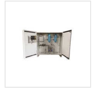
Steam Flow Meter