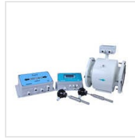
BTU Meter For Chiller Application