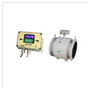
Mega Sroat Electromagnetic Flow