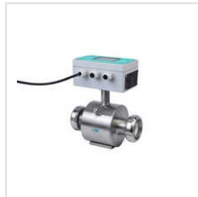
Sanitary And Food Grade Electromagnetic