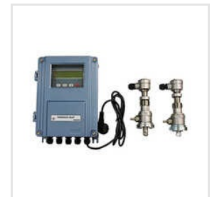
Insertion Type Ultrasonic Flow Meter