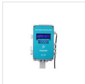
BTU Meter For Heat Transfer Application