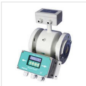
Industrial Full Bore Type Electromagnetic