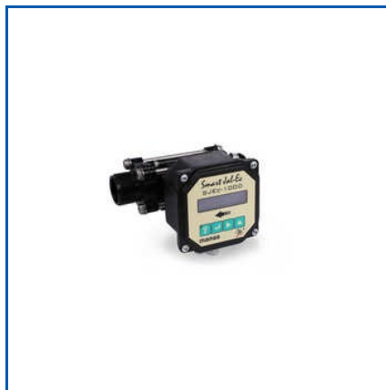
SMART JAL-EC ECONOMICAL FLOW METER