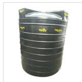
Plastic Water Tank