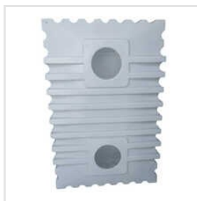
1500 Ltr Loft Water Tank