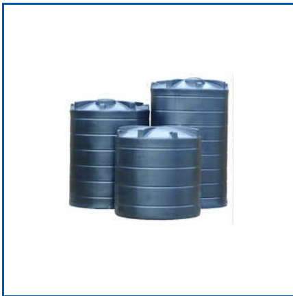
PLASTIC WATER STORAGE TANK

1500 Ltr Loft Water Tank, 2000 Ltr Loft Water Tank, 7500 Ltr Water Storage Tank, Loft Water Tank, Plastic Septic Storage Tank, Plastic Water Storage Tank, Plastic Water Tank, White Plastic Water Storage Tank, etc.