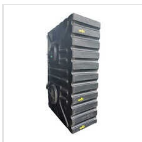
2000 Ltr Loft Water Tank