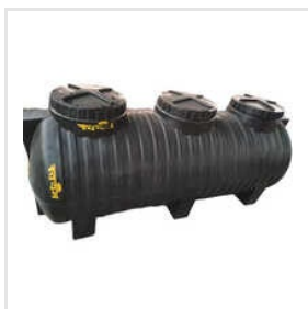
Plastic Septic Storage Tank