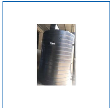
7500 LTR WATER STORAGE TANK