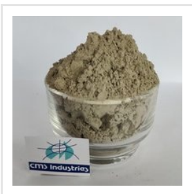
Fly Ash Powder