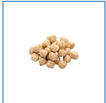
CHICKPEAS KABULI CHANA