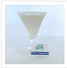
Sodium Silicate Liquid