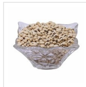
Black Eye Peas