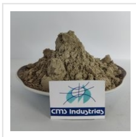
High Grade Fly Ash Powder