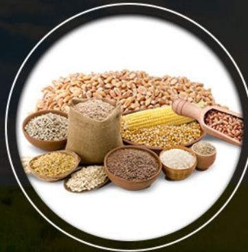
GRAINS & PULSES