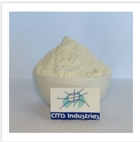
Sodium Carboxy Methyl Cellulose