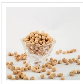
Kabuli Chana Chickpeas