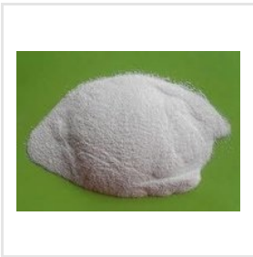
Calcium Chloride Powder