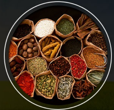
SPICES & HERBS

Acetonitrile Liquid, Acid Proof Bricks, Acid Resistant Bricks, Acid Resistant Mortar Powder, Acid Resistant Tiles, Acidic Ramming Mass, Agriculture Grade Bentonite Lumps, Agriculture Grade Bentonite Powder, Ajwain Seed, All Grades Of Bentonite, Alumina Magnesia Carbon Bricks, Aluminium Sulphate, Aluminium Sulphate Crystal, Aluminium Sulphate Liquid, Aluminium Sulphate Lumps, etc.