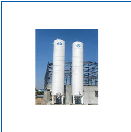
MS CRYOGENIC STORAGE TANK

3 Stage Ejector, Absolute Pressure, Ambient Vaporizers, CNG Products, CO2 Tanks, Cryogenic Storage Tank, Cryogenic Vaporizers, Dry Gas Filter, Filters, Separators and Coalescers, Four Stage Ejector, Gas Filter, Gas Skids, Heat Exchanger & Surface Condenser, Heat Exchangers, etc.