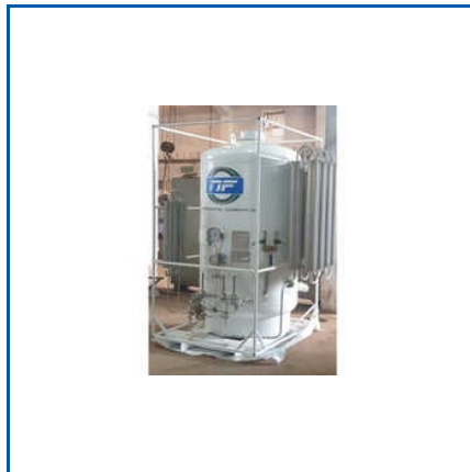
1000 LTR CRYOGENIC STORAGE TANK