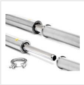
Vacuum Jacketed Piping Line