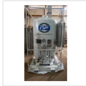
1 KL Cryogenic Storage Tank