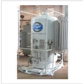
1000 Ltr Cryogenic Storage Tank