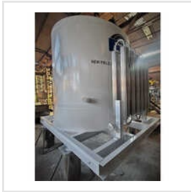
Pallet Mounted Cryogenic Storage