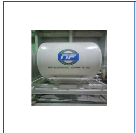
5 KL 17 BAR CRYOGENIC STORAGE TANK