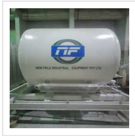
5 KL 17 Bar Cryogenic Storage Tank