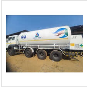
Cryogenic Transport Storage Tank