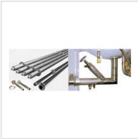
Industrial Vacuum Jacketed Piping Line