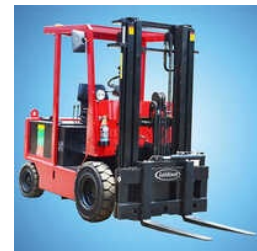
2 TON AC TWIN DRIVE BATTERY OPERATED FORKLIFT