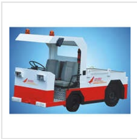
AC Twin Drive Tow Truck