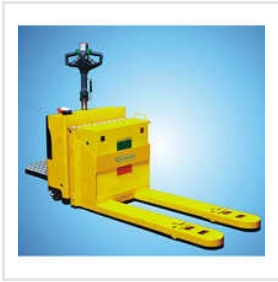
AC Drive Battery Operated Pallet Truck