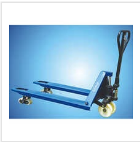
Hand Pallet Truck