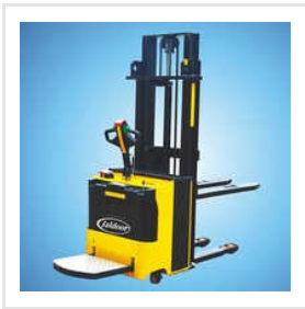
AC Drive Battery Operated Wrap Over