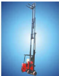
INDUSTRIAL ARTICULATED FORKLIFT

2 Ton AC Twin Drive Battery Operated Forklift, AC Drive Battery Operated Counter Balance Stackers, AC Drive Battery Operated Pallet Truck, AC Drive Battery Operated Tow Truck, AC Drive Battery Operated Wrap Over Stacker, AC Twin Drive Tow Truck, Battery Powered Clamp On Tugger, Customized Battery Operated Shovel, DC Drive Battery Operated Platform Truck, Drive Articulated Forklift, Hand Pallet Truck, Industrial Articulated Forklift, Industrial Manual Stacker, etc.