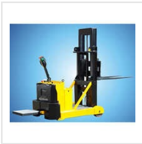
AC Drive Battery Operated Counter