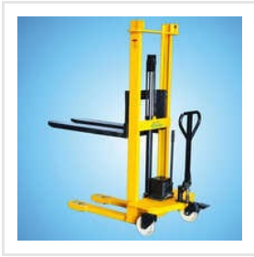
Industrial Manual Stacker