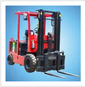
2 Ton AC Twin Drive Battery Operated