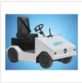
AC Drive Battery Operated Tow Truck