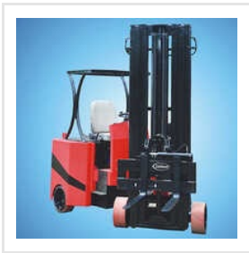
Drive Articulated Forklift