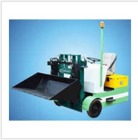
Customized Battery Operated Shovel