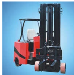
DRIVE ARTICULATED FORKLIFT