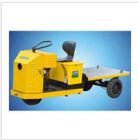
DC Drive Battery Operated Platform