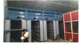
Slotted Angle Mezzanine Floor