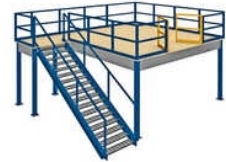
Modular Mezzanine Floor