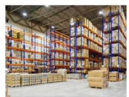
Pallet Rack For Warehouse