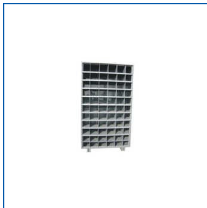
PIGEON HOLE RACK