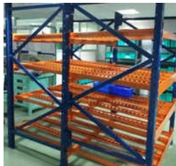
FIFO Rack System