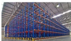
Heavy Duty Pallet Racking System