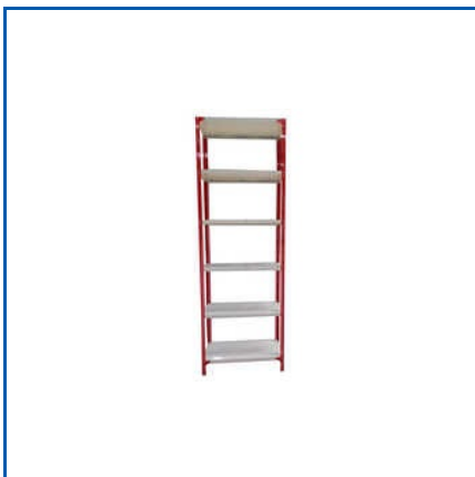
OPEN TYPE SLOTTED ANGLE RACK

3 Side Cover Rack, Automotive Part Rack, Cantilever Racking System, Color Coated Cable Tray, Die Storage Rack, Drum Storage Rack, FIFO Pipe Rack System, FIFO Rack System, Heavy Duty Long Span Shelving System, Heavy Duty Mezzanine Floor, Heavy Duty Multi Tier Rack, Heavy Duty Pallet Rack, Heavy Duty Pallet Racking System, Heavy Duty Steel Rack, Heavy Duty Storage Rack, etc.