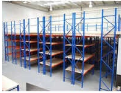
Rack Supported Mezzanine