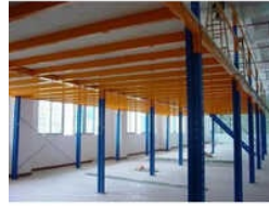
Heavy Duty Mezzanine Floor