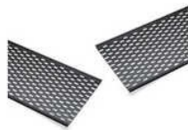
Color Coated Cable Tray