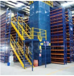
Two Tier Rack