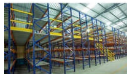
Heavy Duty Multi Tier Rack