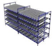
Mild Steel FIFO Rack System