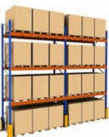
Heavy Duty Pallet Rack