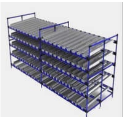
FIFO Pipe Rack System