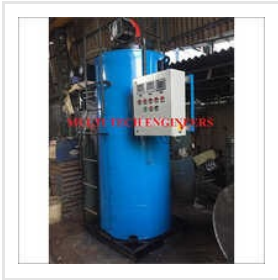
Vertical Oil Or Gas Fired Three Pass