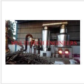
Thermic Fluid Heaters