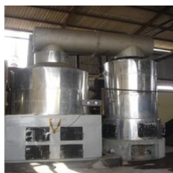
WOOD FIRED THERMIC FLUID HEATER

Coal Thermic Fluid Heater, FBC Thermic Fluid Heater, Gas Oil Fired Thermic Heater, Thermic Fluid Heater, Thermic Fluid Heaters, Vertical Fully Auto Feed System Four Pass Thermic Fluid Heater, Vertical Oil Or Gas Fired Three Pass Thermic Fluid Heater, Vertical Three Pass Reverse Fuel Coil Type Non Ibr Steam Generator, Vertical Three Pass Solid Fuel Fired Thermic Fluid Heater, Wood Fired Thermic Fluid Heater, etc.