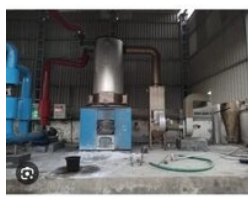
COAL THERMIC FLUID HEATER