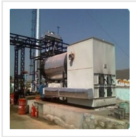
FBC Thermic Fluid Heater