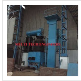
Vertical Fully Auto Feed System Four Pass