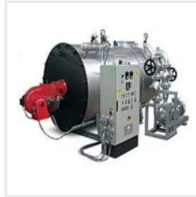
Gas Oil Fired Thermic Heater