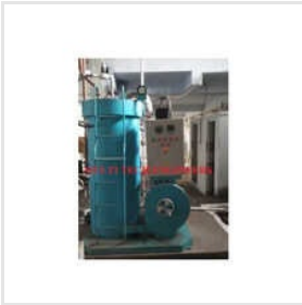
Vertical Three Pass Reverse Fuel Coil Type