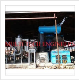
Thermic Fluid Heater