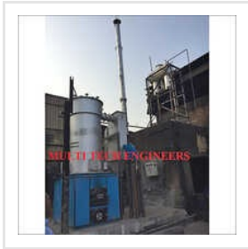
Vertical Three Pass Solid Fuel Fired