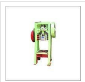
Hydraulic Power Press Machine