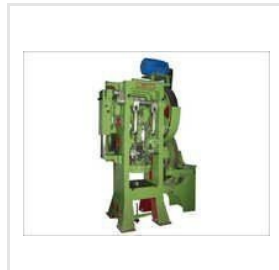
Industrial Deep Drawing Double Action