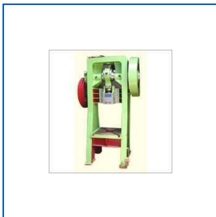
SINGLE ACTION POWER PRESS MACHINE