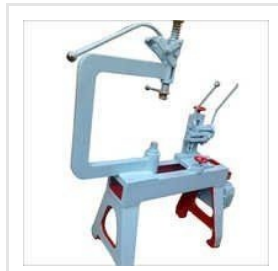
Heavy Duty Beading Machine