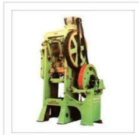
Double Action Power Press