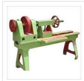
Industrial Spinning Lathe Machine