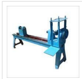
Pneumatic Spinning Lathe Machine