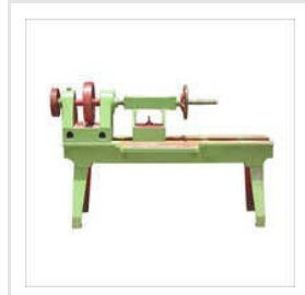
Spinning Lathe Machines