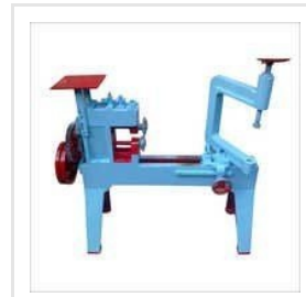
Bowl Cutter Machine