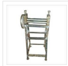
Bead Roller Machine