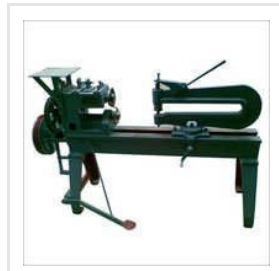
Industrial Circle Cutter Machinery