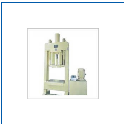
DEEP DRAW HYDRAULIC PRESSES

Bead Roller Machine, Beading Machines, Bowl Cutter Machine, Deep Draw Hydraulic Presses, Deep Drawing Double Action Power Press, Double Action Power Press, Heavy Duty Beading Machine, Hydraulic Power Press Machine, Industrial Beading Machine, Industrial Circle Cutter Machinery, Industrial Deep Drawing Double Action Power Press, Industrial Sanda Machine, Industrial Spinning Lathe Machine, Machine Repairing Services, Pneumatic Spinning Lathe Machine, etc.