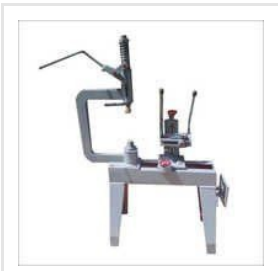
Industrial Beading Machine