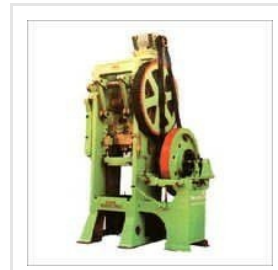
Deep Drawing Double Action Power Press