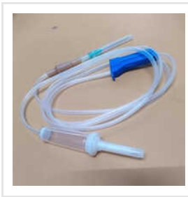
Infusion IV Set (Sterile)