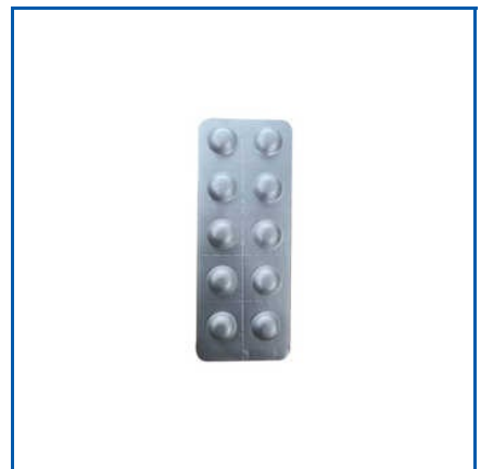
MONTELUKAST AND BILASTINE TABLET