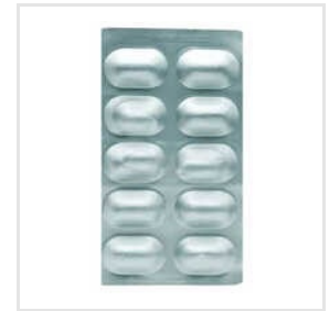
Paracetamol Aceclofenac And