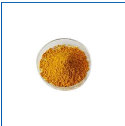
FOLIC ACID API

Folic Acid API, Infusion IV Set (Sterile), Metformin HCL API, Montelukast And Bilastine Tablet, Multivitamin Multimineral And Antioxidant Capsule, Paracetamol Aceclofenac And Serratiopeptidase, Sterile Surgical Glove, etc.