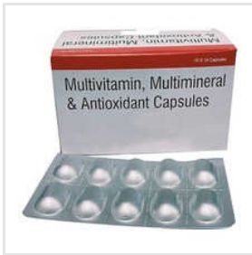
Multivitamin Multimineral And