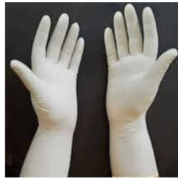
Sterile Surgical Glove