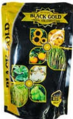
Organic Soil Conditioner