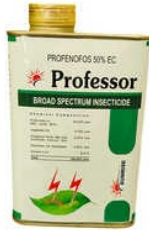
Board Spectrum Insecticide