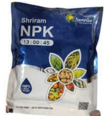
NPK 13-00-45 Water Soluble Fertilizer