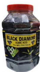
BLACK DIAMOND HUMIC ACID

Black Diamond Humic Acid, Board Spectrum Insecticide, Brahmastra Emamectin Benzoate 5% SG Insecticide, Ferrodon 3G Carbofuran 3 CG Insecticide, Fighter Chlorantraniliprole 0.4% GR Insecticide, Glacier-71 Ammonium Salt Glyphosate 71% SG Systemic Herbicide, Killer-505 Chlorpyrifos 50 Cypermethrin 5 EC Insecticide, etc.