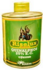
Riselux Quinalphos 25% EC Insecticide