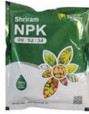
NPK 00-52-34 Water Soluble Fertilizer