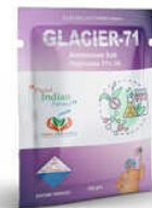
Glacier-71 Ammonium Salt Glyphosate 71% SG