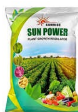
Sun Power Plant Growth Regulator