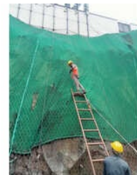
ROCK FALL NETTING