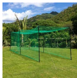
Cricket Ground Net