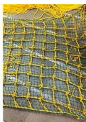
Cargo Safety Net