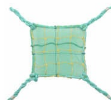
Green Safety Net