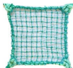
Double Braided Safety Net