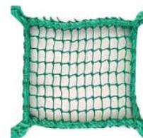
Braided Safety Net