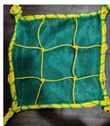
Double Layer Safety Net