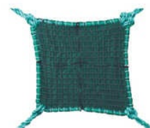
Garware DNS Safety Net