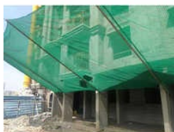
Construction Safety Net