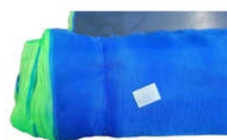
Hdpe Monofilament Net