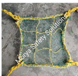
Construction Safety Net