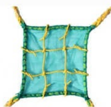
Monofilament Vertical Safety Net