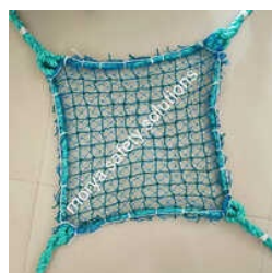
Construction Safety Net