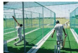
Sports Cricket Net