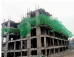
Safety Net For Construction