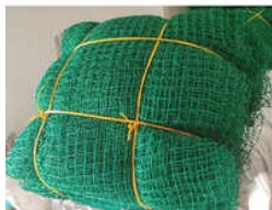
Single Braided Layered Cricket Net