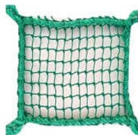
MACHINE MADE SAFETY NET