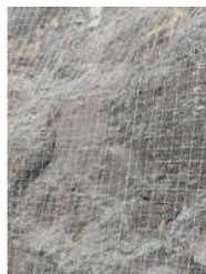
Mountain Rockfall Safety Net