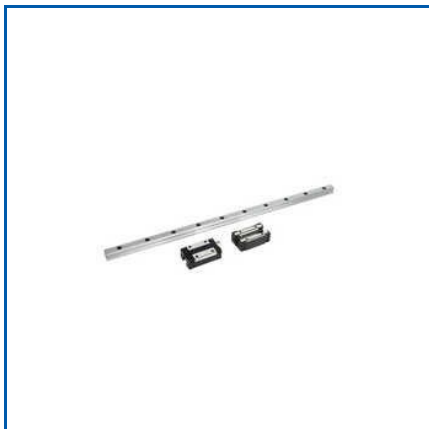
HGH55HA LINEAR MOTION GUIDE WAY

12 MM Linear Shaft, 150F Leveling Caster Wheel, 16 MM Linear Shaft, 20 MM Linear Shaft, 20x20 MM Aluminium Angle Bracket, 20x20 MM Aluminum Extrusion, 20x20 MM Inner Bracket, 20x20 MM M5 MS Sliding T Nut, 20x40 MM Aluminum Extrusion, 20x60 MM Aluminum Profile, 24 MM V Slot Caster Wheel, 25 MM Linear Shaft, 30 MM Linear Shaft, 30x30 Aluminum Angle Bracket, 30x30 MM Aluminum Extrusion, etc.