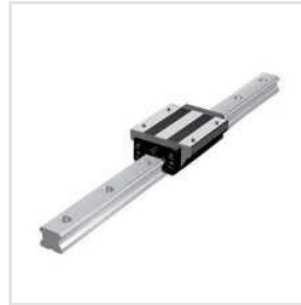
HGH65CA Linear Motion Guide Way