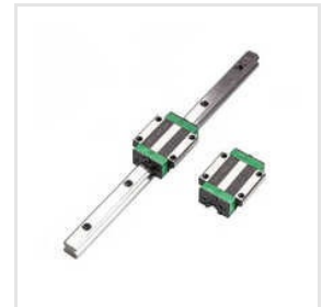
HGH30HA Linear Motion Guide Way