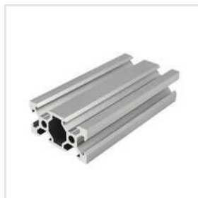
20x40 MM Aluminum Extrusion