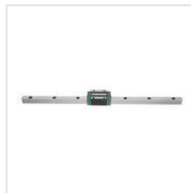
HGH45HA Linear Motion Guide Way