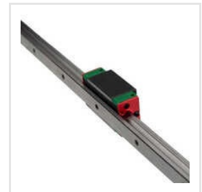
Linear Guide Rail