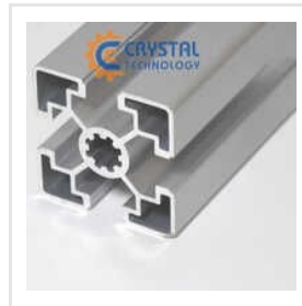
45x45 MM Aluminum Extrusion