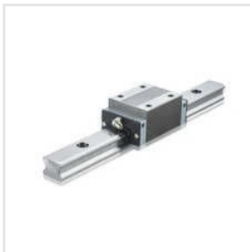
HGH35HA Linear Motion Guide Way