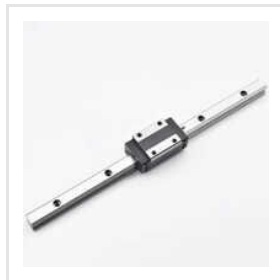
HGH65HA Linear Motion Guide Way