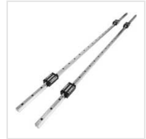
HGW20CC Linear Motion Guide Way