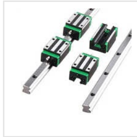
HGH25HA Linear Motion Guide Way