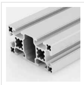
40x80 MM T Slot Aluminium Extrusion