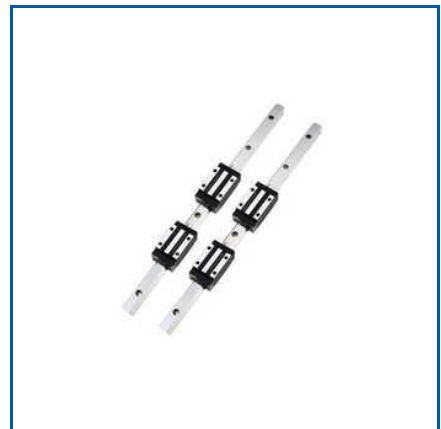
HGH45CA LINEAR MOTION GUIDE WAY