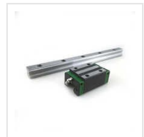
HGH15CA Linear Motion Guide Way