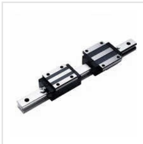
HGH20CA Linear Motion Guide Way