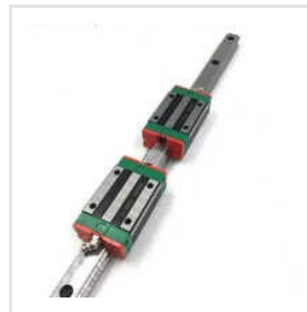
HGH35CA Linear Motion Guide Way