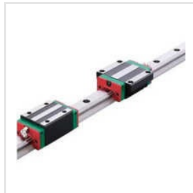
HGW15CC Linear Motion Guide Way