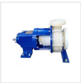
Polypropylene Monoblock Pump