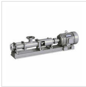
Progressive Cavity Screw Pump