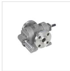
Thermic Fluid Hot Oil Pump