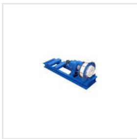
Polypropylene Centrifugal Pump