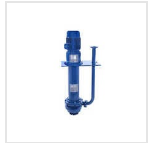
CI Vertical Sump Pump