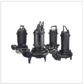
Non Clog Mud Sewage Pump