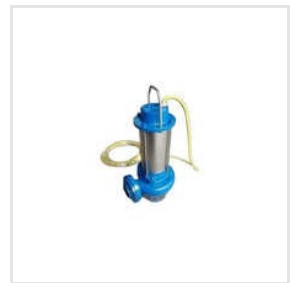
1000 LPM Submersible Pump Set