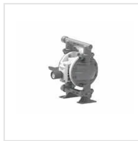
SS316 Air Operated Double Diaphragm