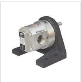
Rotary Gear Pump With Motor