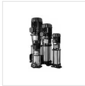
Industrial Vertical Inline Pump