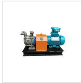
SS316 Solvent Transfer Pump