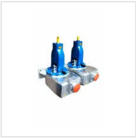
10HP Non Clog Pump