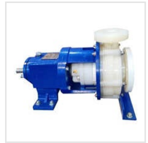
PVDF Centrifugal Pump