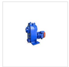
10HP Self Priming Pump