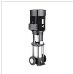
Ro High Pressure Pump