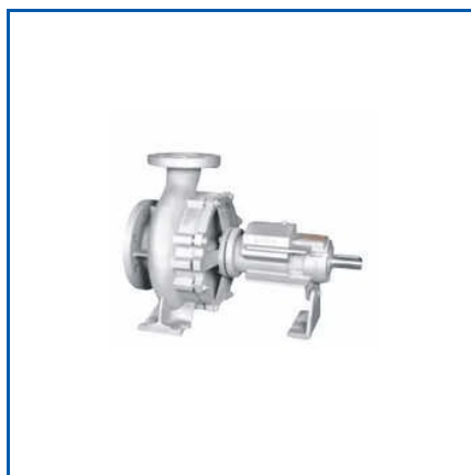
10HP THERMIC FLUID PUMP