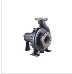
500LPM Chemical Process Pump