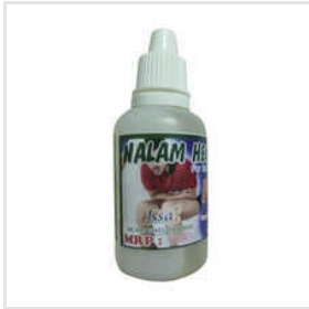
Pile Cure Oil