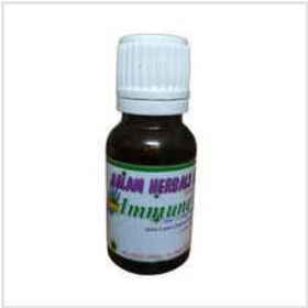
15 ML Immune Booster Oil