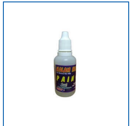
30 ML PAIN RELIEF OIL