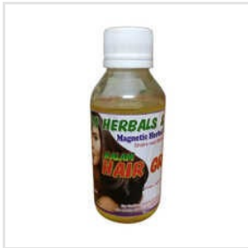
100 ML Hair Growth Oil