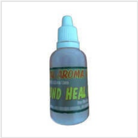
30 ML Wound Heal Oil