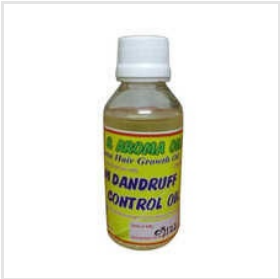
100 ML Nalam Dandruff Control Oil