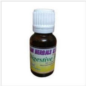
15 ML Digestive Booster Oil