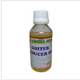
100 ML Goiter Reducer Oil