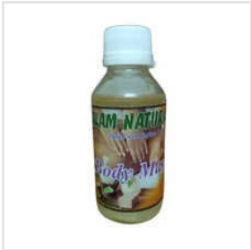
100 ML Body Massge Oil