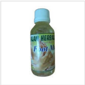
100 ML Foot Massage Oil