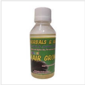
Nalam Hair Growth Oil