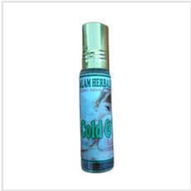
Cold And Flu Classic Roll-On