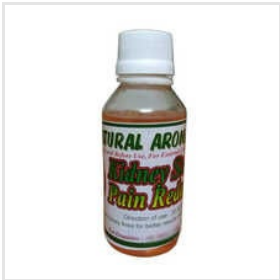
100 ML Kidney Stone Pain Reducer