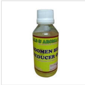
100 ML Abdomen Belly Reducer Oil