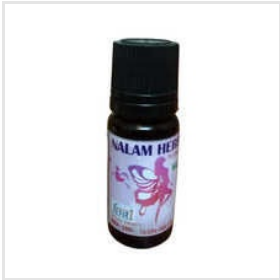
10 ML Veginal Hygeine Oil