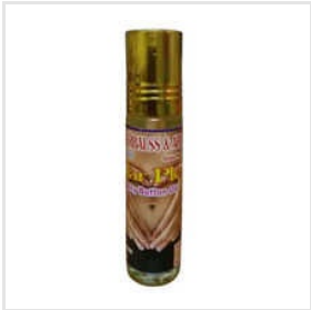
8 ML Belly Button Oil