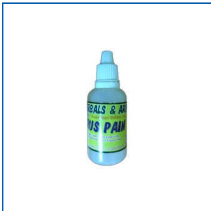
30 ML UTERUS PAIN OIL

10 ML Vaginal Hygiene Oil, 100 ML Abdomen Belly Reducer Oil, 100 ML Body Massage Oil, 100 ML Foot Massage Oil, 100 ML Goiter Reducer Oil, 100 ML Hair Growth Oil, 100 ML Kidney Booster Oil, 100 ML Kidney Stone Pain Reducer, 100 ML Liver Booster Oil, 100 ML Nalam Dandruff Control Oil, 100 ML Varicose Vein Reducer Oil, 15 ML Digestive Booster Oil, 15 ML Immune Booster Oil, 20 ML Cold And Flu Oil, 30 ML Herbal Skin Care Oil, etc.