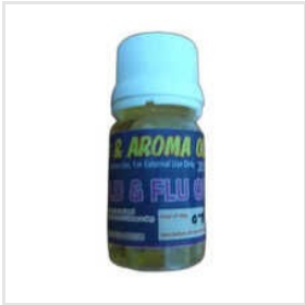
20 ML Cold And Flu Oil