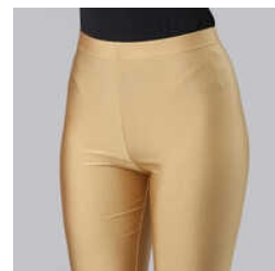
GOLDEN SHIMMER LEGGING