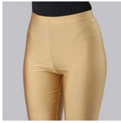
Golden Shimmer Legging