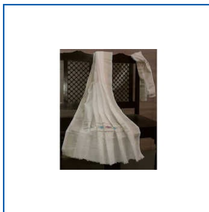
LADIES COTTON PAITHANI DUPATTA