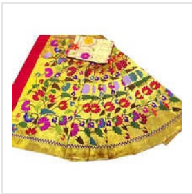
Ladies Designer Tissue Paithani Lehenga