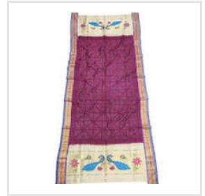
Traditional Paithani Dupatta With