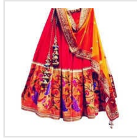
Ladies Designer Paithani Lehenga