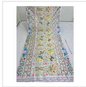
Ladies Silver Tissue Expensive Exclusive