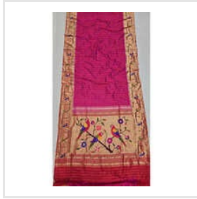
Checks Mor Popat Saree