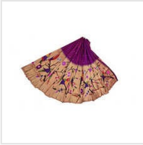
Ladies Paithani Lehenga