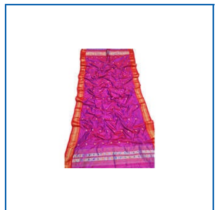
LADIES TRADITIONAL PYTHON DUPATTA