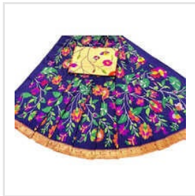
Ladies Tissue Paithani Lehenga