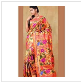
Tissue Jaal Brocade Bridal Saree