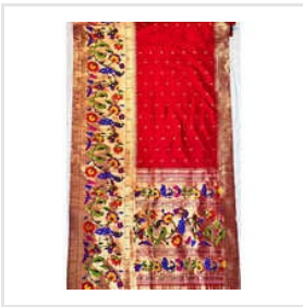
Ladies Border Design Saree