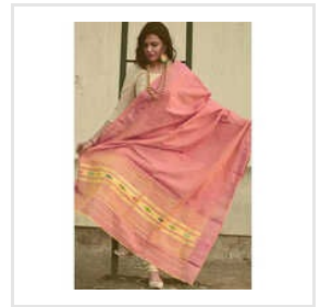
100% Cotton Paithani Dupatta