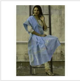
Pure Cotton Paithani Dupatta