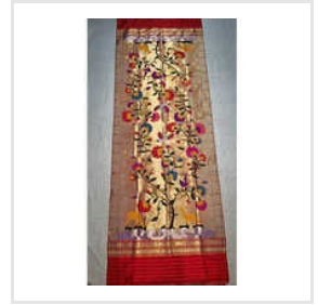
Ladies Tissue Dupatta