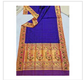
Ladies Asawali Design Border Bracket Titan