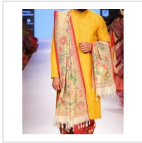
Ladies Paithani Dupatta