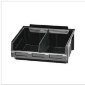
SB7-C ESD Bins