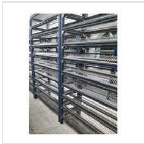
ESD Safe SMD Reel Rack 7 Inch