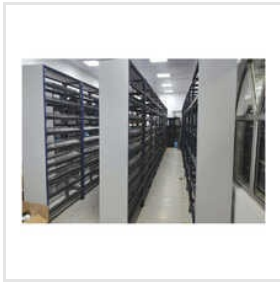
ESD Safe SMD Reel Rack 13 Inch