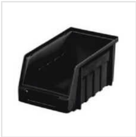
SB2-C ESD Bins