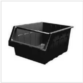
SB8-C ESD Bins