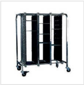
PCB Storage Trolley