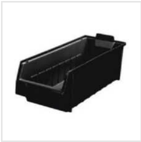
SB6-C ESD Bins