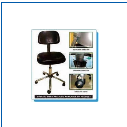
ESD SAFE CHAIR

2-3 Fan Ionizer, 603DT SMD Rework Station, Access System With Turnstile Or Flap Barrier, Anti Fatigue Mat, Antifatigue Mat, Antistatic Channel Brush, Automatic Wire Cutting And Stripping Machine For Multicore And Battery Cables - Rae-ser 2, Bar Type Ionizer, Bar Type Static Eliminator, Belt Conveyor With Work Table, Carrier Type Dual Wave Soldering Machine, Combo Tester, Combo Tester Z124, Combo Tester Z134 + Stand Z134S, Common Ground Point, etc.