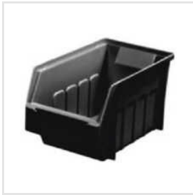
SB3-C ESD Bins