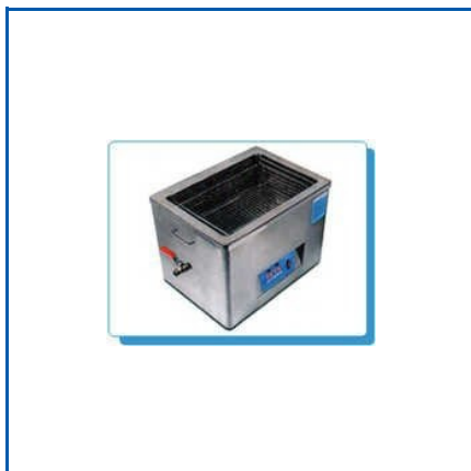
MECHANICAL ULTRASONIC CLEANING MACHINE