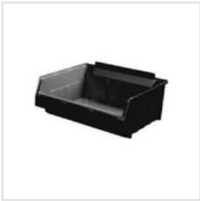
SB5-C ESD Bins