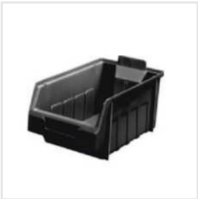
SB4-C ESD Bins