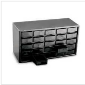
ESD Component Organiser