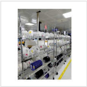
Reel Rack Trolley