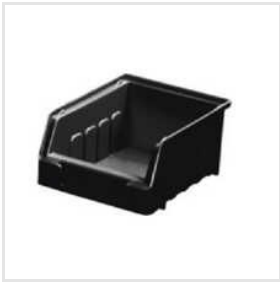
SBI-C ESD Bins