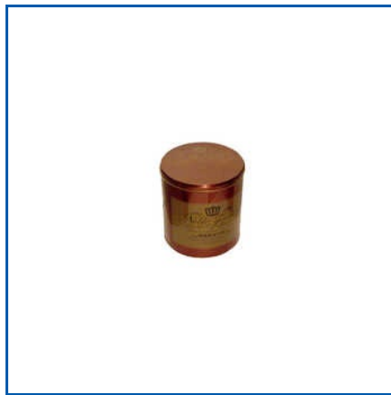
ROUND TIN BOX