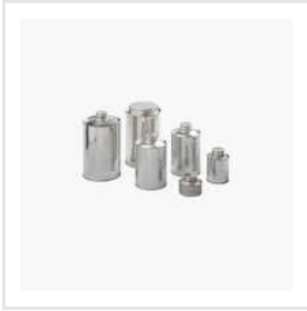
Cone Top Cans