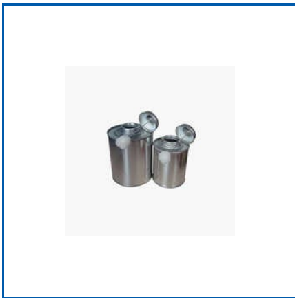
BRUSH IN CAN TINS

Brush In Can Tins, Cone Top Cans, Rectangular Tins, Round Tin Box, Screw Top Tin, Slip Lid Tin, Spout Cylinder Tins, etc.