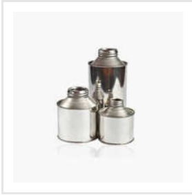
Screw Top Tin