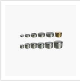
Slip Lid Tin