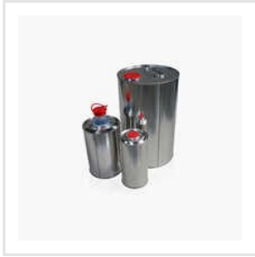
Spout Cylinder Tins