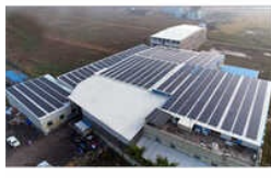
300 KW Trunkey Project