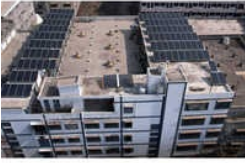
50 KW Trunkey Project