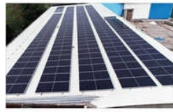
200 KW Trunkey Project