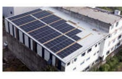
70 KW Trunkey Project