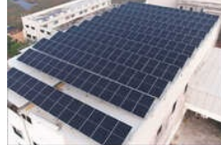
100 KW Trunkey Project