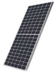
Mono Bifacial Solar Panel