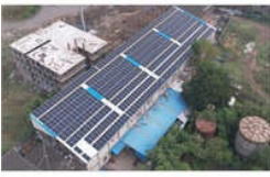
250 KW Trunkey Project