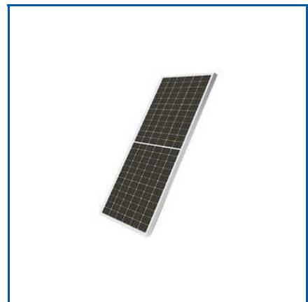
MONO HALF CUT SOLAR PANEL