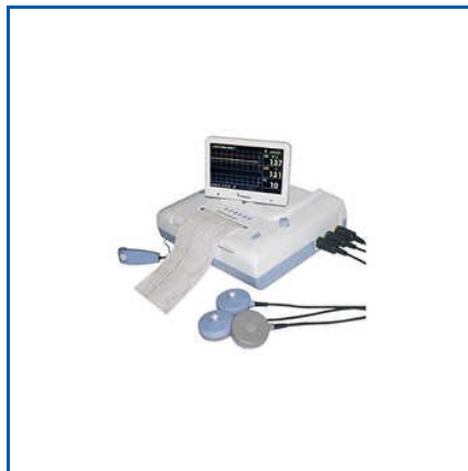
BT-350 SCURE FETAL MONITOR