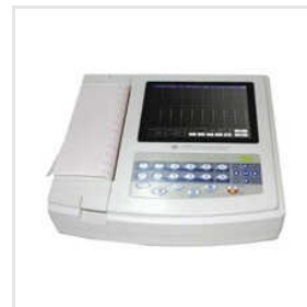
ECG 1201 Twelve Channel ECG Machine