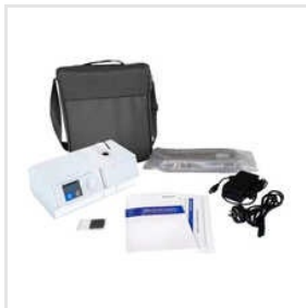
Scure Rescue CPAP Machine