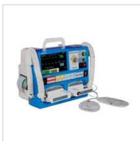
Scure Biphase Defibrillator