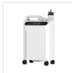
Scure Oxycore Feather 5LPM