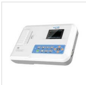
ECG 300 Digital Three Channel ECG Machine