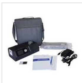
Scure Rescue BIPAP 30T Machine