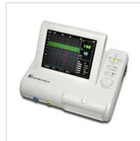
FM 101 Scure Fetal Monitor