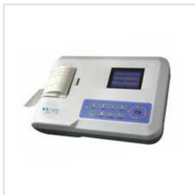
ECG 300 Three Channel ECG Machine