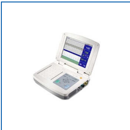
FM 301 SCURE FETAL MONITOR

ACCU Sure Blood Pressure Machine, Amkay Glucometer And Strip, Anti-Decubitus Airbed Therapy, BP-14 Blood Pressure Monitor, BPL Digital Blood Pressure Monitor, BT-350 Scure Fetal Monitor, Blood Glucose Test Strips, Blood Pressure Monitor, Comfort Touch Latex Powdered Examination Glove, Digital Hemoglobin Meter, Digital Pulse Oxymeter, Digital Thermometer, Digital Weight Machine, Disposable ECG Eletrodes, Disposable Long Glove, etc.