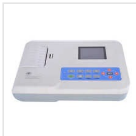
Three Channel ECG Machine