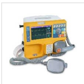
Portable Biphase Defibrillator