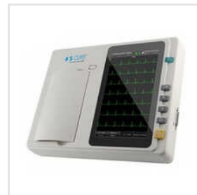
ECG 300 GD ECG Machine