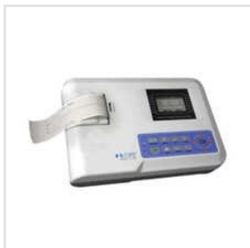
ECG 100 Single Channel ECG Machine