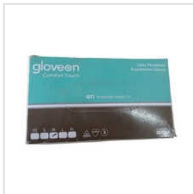
Comfort Touch Latex Powdered Examination