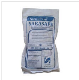
Sterile Latex Surgical Glove