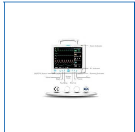
SCURE PATIENT MONITOR MP 1220