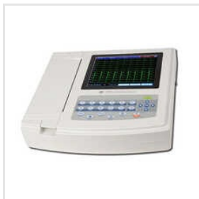
Scure 12 Channel ECG Machine