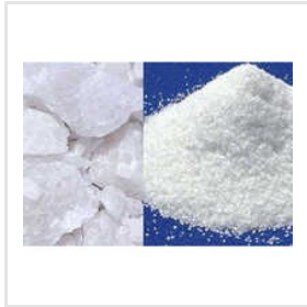
Silica Ramming Mass