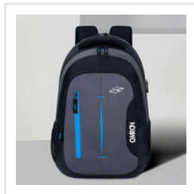
Office Laptop Backpack