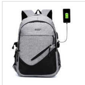
USB Charging Backpack