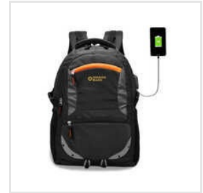
Black Travel Backpack