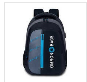
Multi-Functional Smart Backpack