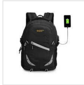
Sky Bag School Bags