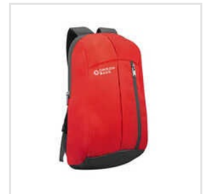
Kids Red School Bag