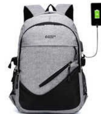
LAPTOP BACKPACK WITH USB CHARGING PORT