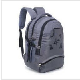
Polyester School Bag