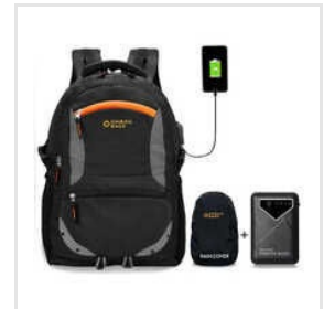
Polyester Unisex Backpack