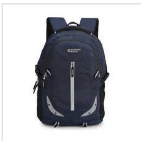
Polyester Laptop Backpack