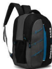
PRINTED LAPTOP BACKPACK