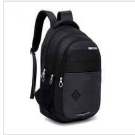
Girls School Backpack