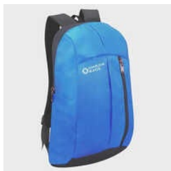
WOMEN'S MINI POLYESTER BACKPACK

12 Ltr Girls Backpack, 30L Polyester Office Bags, Black Anti Theft Backpack, Black Fancy Backpack, Black Polyester Travelling Backpack, Black Promotional Bag, Black Teenager Backpack, Black Travel Backpack, Blue VIP Backpacks, College Backpack For Boys, Fancy Travel Backpack, Girls School Backpack, Kids Red School Bag, Laptop Backpack With USB Charging Port, Multi-functional Smart Backpack, etc.