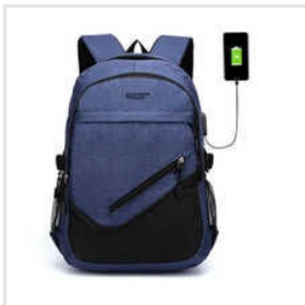
Laptop Backpack With USB Charging Port