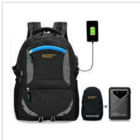
Black Fancy Backpack