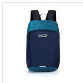
12 Ltr Girls Backpack