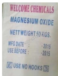
Magnesium Oxide Powder