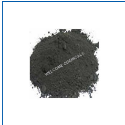
MANGANESE DIOXIDE POWDER