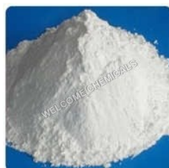
Calcium Carbonate PPT