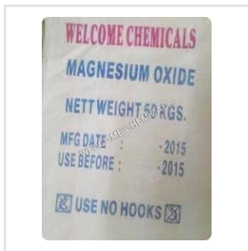
Magnesium Oxide Powder