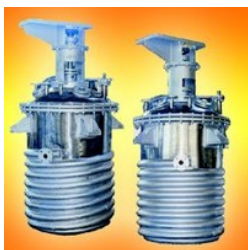
Limpet Coil Vessel