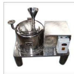
Pilot Scale Centrifuge