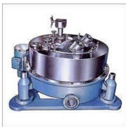
3 Point Manual Bottom Discharge Centrifuge