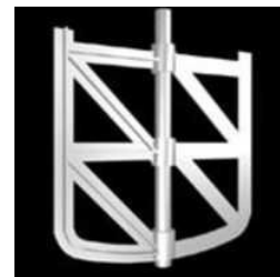
ANCHOR DOUBLE AGITATOR