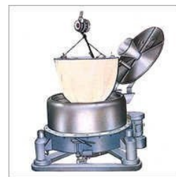
Three Point Bag Lifting Top Discharge