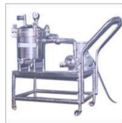
Sparkler Filters Machine