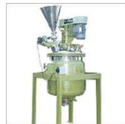
Jacketed Reaction Vessel