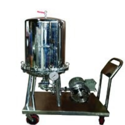
Zero Holdup Sparkler Filter