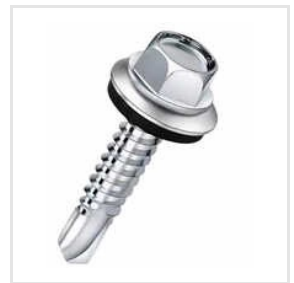
Hex Head Self Drilling Screw