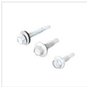
CSK Head Self Drilling Screws