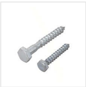
Hex Head Coach Screws