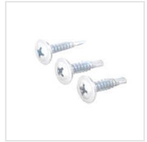
Truss Head Self Drilling Screws