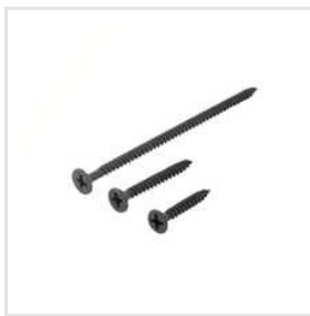
Dry Wall Screws