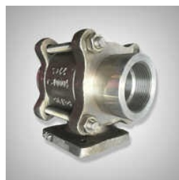
3000 PSI Threaded End Ball Valve