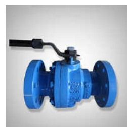
600 Lever Operated Ball Valve