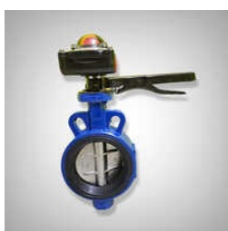
Butterfly Valve With Open Close Indicator