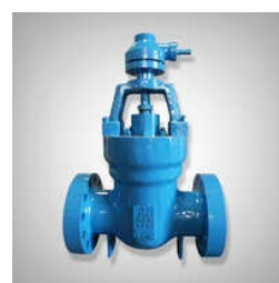
Pressure Seal Gate Valve