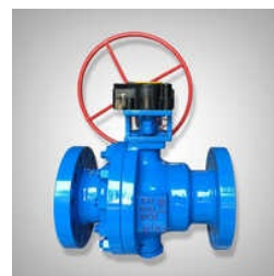
600 Gear Operated Ball Valve