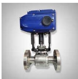
600 Electric Actuated Ball Valve