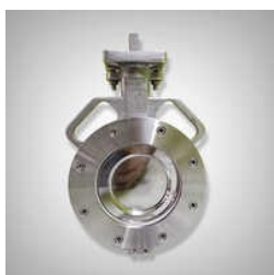
Offset Disc Butterfly Valve