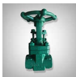
Industrial Forged Gate Valve