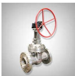
Gear Operated Gate Valve