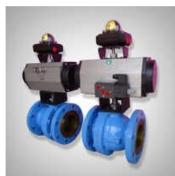
2PC Pneumatic Actuated Ball Valve