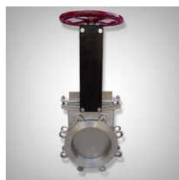
Stainless Steel Knife Gate Valve