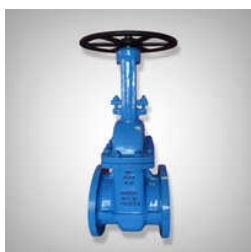
API 600 Gate Valve