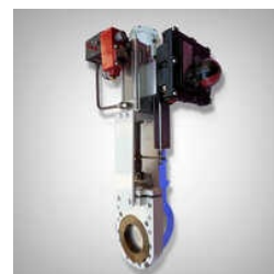
BI-DIRECTIONAL WITH POSITIONER KNIFE GATE VALVE