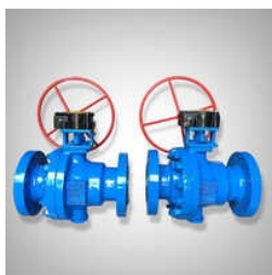
MS Ball Valve