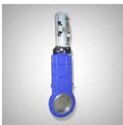
BONNETED TYPE KNIFE GATE VALVE