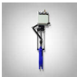
POSITIONER TYPE KNIFE GATE VALVE

2PC Pneumatic Actuated Ball Valve, 3000 PSI Threaded End Ball Valve, 600 Electric Actuated Ball Valve, 600 Gear Operated Ball Valve, 600 Lever Operated Ball Valve, 900nb Dual Disc NRV Under Surface Finish Check Valve, API 600 Gate Valve, Bi-Directional With Positioner Knife Gate Valve, Bonneted Type Knife Gate Valve, etc.