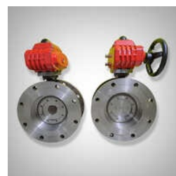
Industrial Butterfly Valve