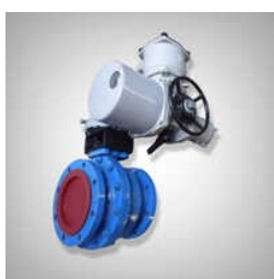
Electrical Actuator Operated Ball Valve