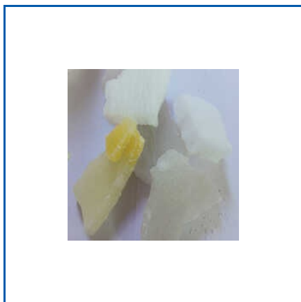
FOOD GRADE (3F) NAUSHADAR