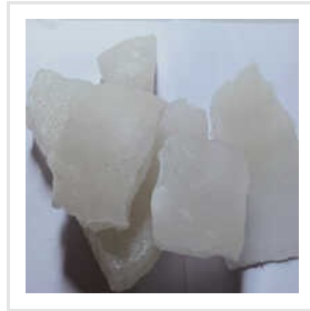
Special Grade (3P) Naushadar