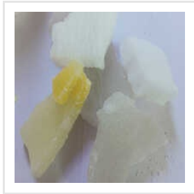
Food Grade (3F) Naushadar