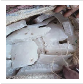
Regular Grade Naushadar