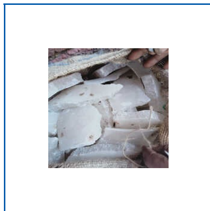
REGULAR GRADE NAUSHADAR