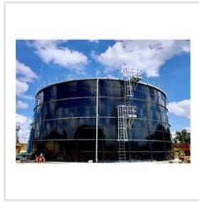
Industrial GLS Tanks