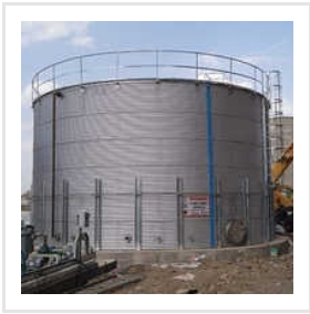
Industrial Zincalume Steel Tanks