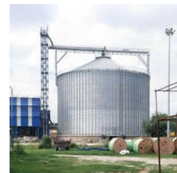
HEAVY DUTY GRAIN STORAGE SILO