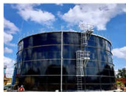
INDUSTRIAL GLS TANKS