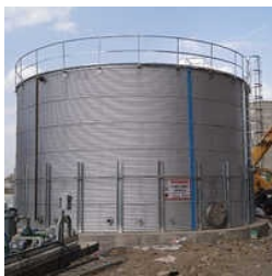
INDUSTRIAL ZINCALUME STEEL TANKS

Heavy Duty Grain Storage Silo, Industrial GLS Tanks, Industrial Zincalume Steel Tanks, etc.