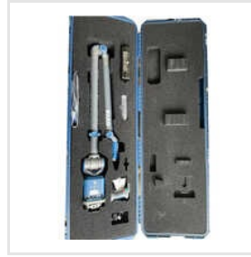
CMM Inspection Services