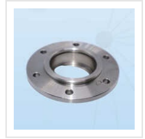
Round Steel Flanges