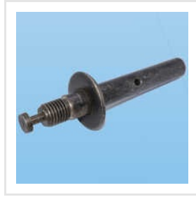
Industrial Steel Stud