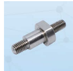
SCREW NUT BOLT