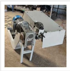
Scraper Chip Conveyor