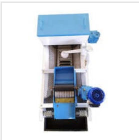
Industrial Paper Band Filtration System