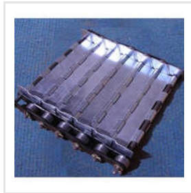
Industrial Conveyor Chain