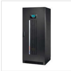
Industrial Online UPS