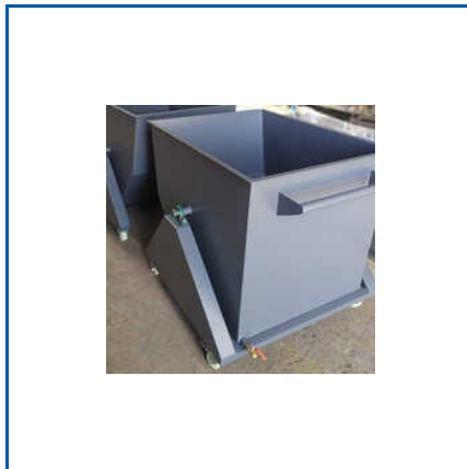
INDUSTRIAL CHIP TROLLEY