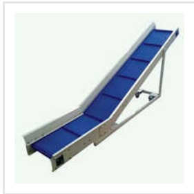
Material Movement Conveyor