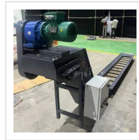
02_Hinged Steel Belt Chip Conveyor