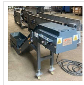
01_Hinged Steel Belt Chip Conveyor