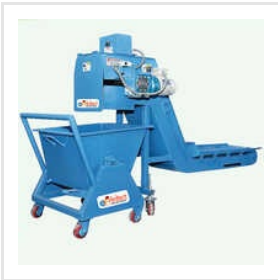
Hinge Belt Conveyor