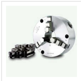
Industrial Power Chuck