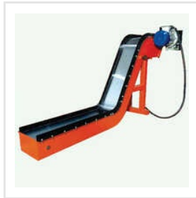
Magnetic Chip Conveyor