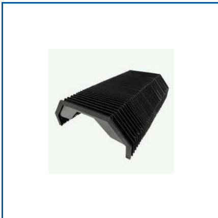
INDUSTRIAL BELLOW COVER

01_Hinged Steel Belt Chip Conveyor, 02_Hinged Steel Belt Chip Conveyor, Hinge Belt Conveyor, Industrial Bellow Cover, Industrial Chip Trolley, Industrial Conveyor Chain, Industrial Online UPS, Industrial Paper Band Filtration System, Industrial Power Chuck, Industrial Sump Sucker Pump, Magnetic Chip Conveyor, Material Movement Conveyor, Roller Conveyor, Scraper Chip Conveyor, etc.