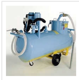
Industrial Sump Sucker Pump