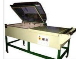
Chamber Type Shrink Wrapping