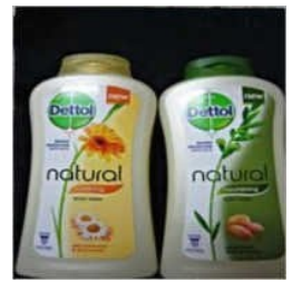
Polyolefin Shrink Films