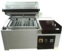
Manual Chamber Shrink Machines