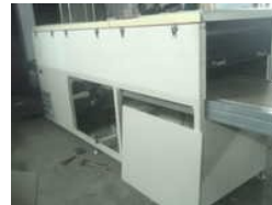
Industrial Shrink Wrapping Machines