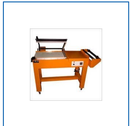
L TYPE SEALING MACHINE