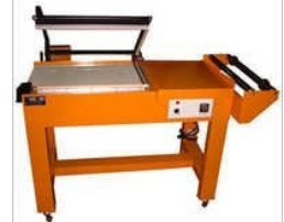
L Type Sealing Machine