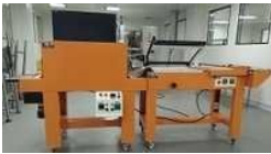
Industrial Semi Automatic Shrink