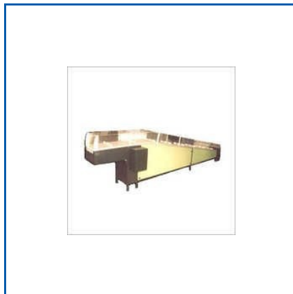
INDUSTRIAL CONVEYOR SYSTEMS