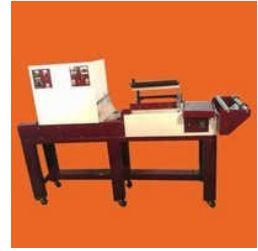
Mono Block Semi Automatic Shrink