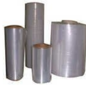
Poly Oil Fine Shrink Film