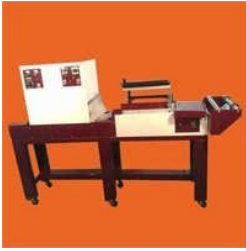
Semi Automatic Shrink Machines