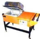
Shrink Packaging Machines