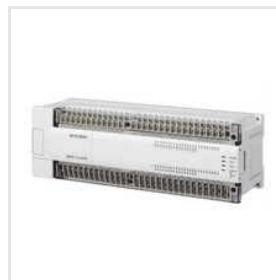
Analog Mitsubishi PLC System