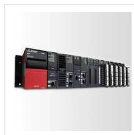
Mitsubishi Melsec IQR PLC System