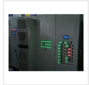
220 V Paint Booth Control Panel