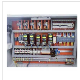
Three Phase PLC Control Panel