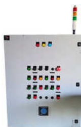
RELAY CONTROL PANEL