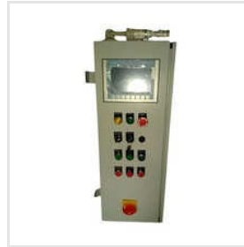
Single Phase PLC Control Panel