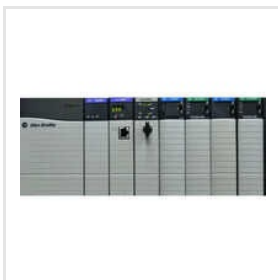
Allen Bradley PLC System