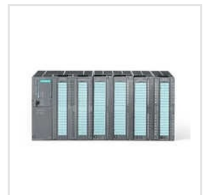
Siemens PLC System