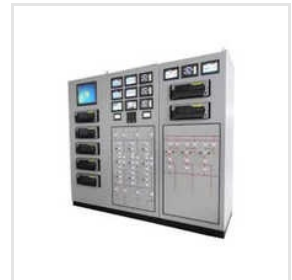
DCS Control Panel