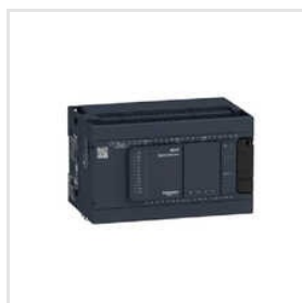
Schneider Electric PLC System