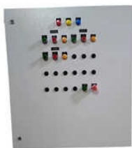
MIXER CONTROL PANEL

100V AC PLC Programming Services, 220 V Paint Booth Control Panel, 240 V AC Pick To Light System, 415 V Electrical Control Panel, Allen Bradley HMI Touch Panel, Allen Bradley PLC System, Analog Mitsubishi PLC System, DCS Control Panel, DCS PLC Programming Services, Delta PLC System, Digital ABB PLC System, Engine Testing Control Panel, HMI Integration System, HMI Programming Services, Heater Control Panel, etc.