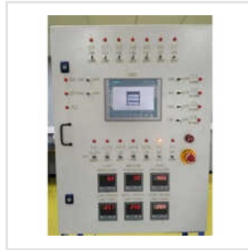
Engine Testing Control Panel