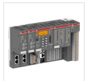
Digital ABB PLC System