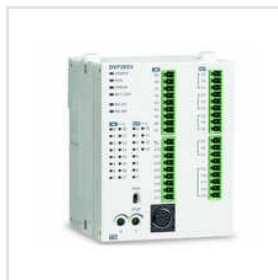
Delta PLC System