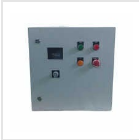
VFD Control Panel