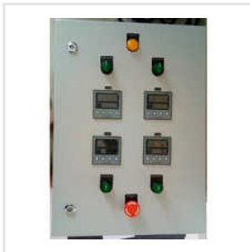
Heater Control Panel