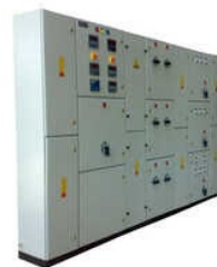
SINGLE PHASE PCC CONTROL CENTER PANEL