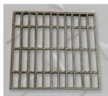
Wire Mesh Grating