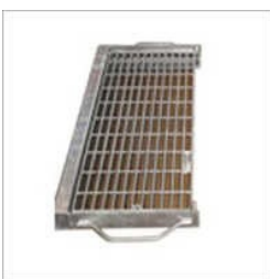
Metal Drainage Channel