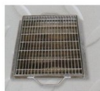
Heavy Metal Grating