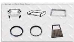
Manhole Basin Risers