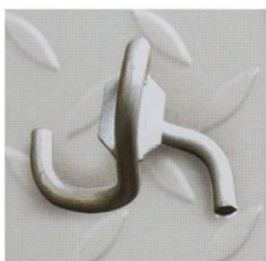
Fabricated Grating Equipments