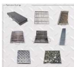
INDUSTRIAL FABRICATED GRATINGS