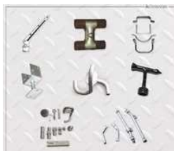
Construction Material Tool