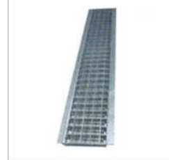
Standard Drainage Channel