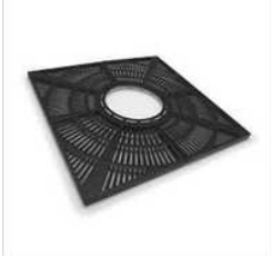
Plastic Tree Grate