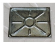
FABRICATED GRATING PRODUCT