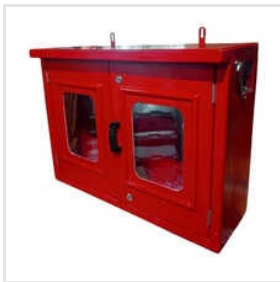
Double Door Fire Hose Box