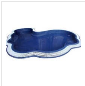
FRP Plunge Pool