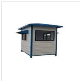
FRP Portable Security Cabin