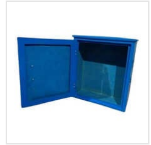
Color Coated FRP Junction Box