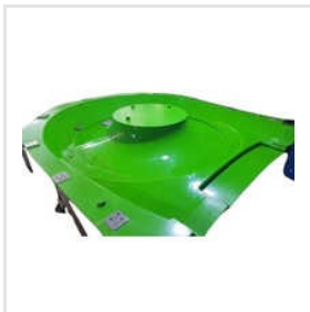
FRP Cover Mould Machine