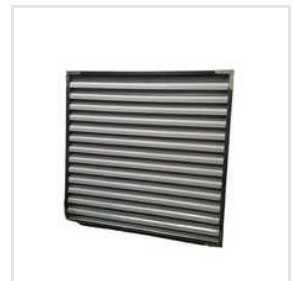
Silver FRP Ventilation Louvers