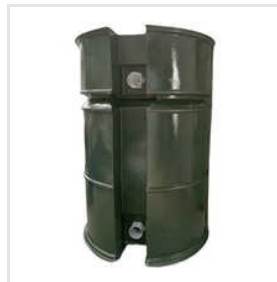
1000Ltr FRP Water Tank