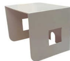
FRP MOTOR CANOPY