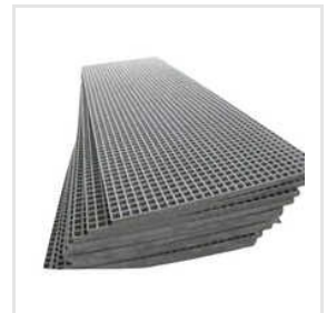
FRP Moulded Grating