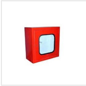
Single Door FRP Fire Hose Box