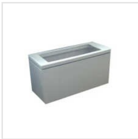
Rectangular FRP Utility Box