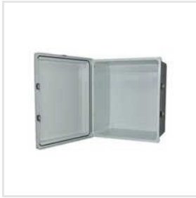
FRP Waterproof Junction Box