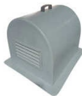
FRP MOTOR COVER CANOPY