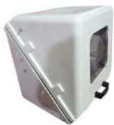
FRP INSTRUMENT CANOPY

1000Ltr FRP Water Tank, Aquarium Fish Tank Cover, Color Coated FRP Junction Box, Double Door Fire Hose Box, FRP Battery Box, FRP Cover Mould Machine, FRP Customised Chamber Trench Covers, FRP Instrument Canopy, FRP Motor Canopy, FRP Motor Cover Canopy, FRP Moulded Grating, FRP Plunge Pool, FRP Portable Security Cabin, FRP Two Band Utility Box, FRP Waterproof Junction Box, etc.