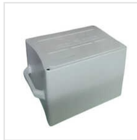
FRP Battery Box