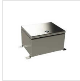
FRP Two Band Utility Box