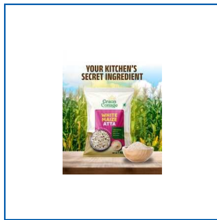
1KG WHITE MAIZE ATTA