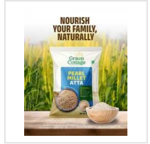
1Kg Pearl Millet Atta