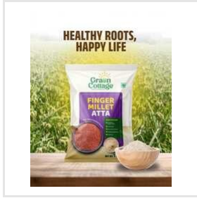
1Kg Finger Millet Atta