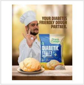
1Kg Diabetic Atta