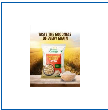
5KG SHARBATI WHEAT ATTA

1Kg Desi Jowar Atta, 1Kg Diabetic Atta, 1Kg Diet Atta, 1Kg Finger Millet Atta, 1Kg Pearl Millet Atta, 1Kg White Maize Atta, 5Kg Sharbati Wheat Atta, etc.