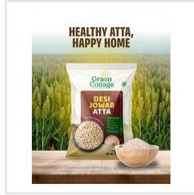
1Kg Desi Jowar Atta